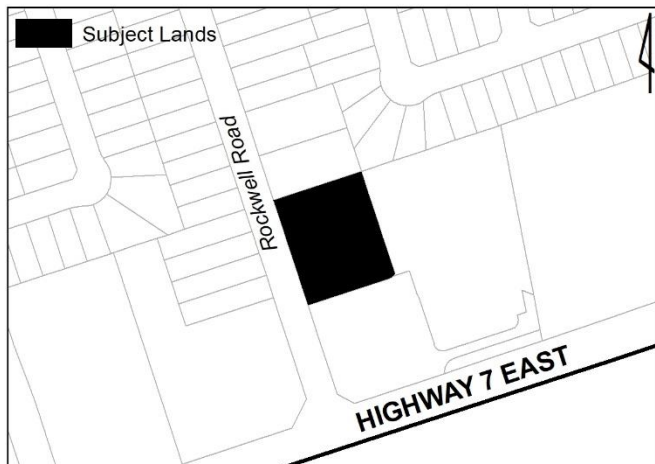
Map 2. Location of Rockwell Parkette

Location: Ward 6, Rockwell Road, see Map 2