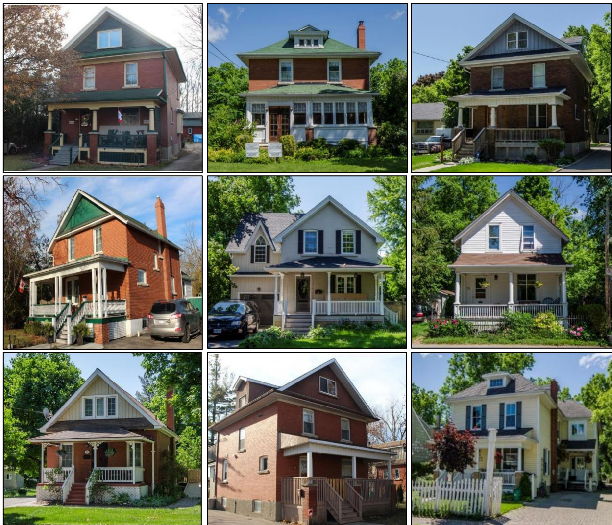
Houses built by William Graham on Centre Street East. Clockwise from top left: 48 Centre Street East; 53 Centre Street East (subject property); 58 Centre Street East; 59 Centre Street East; 72 Centre Street East; 75 Centre Street East; 76 Centre Street East; 82 Centre Street East; 90 Centre Street East. Photos taken c.2017.

Designating 53 Centre Street East will help to protect a contributing resource to the area's unique historical character, which is valued by residents and visitors alike.