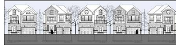
3 STREETSCAPE - LOTS 1-5 SPT 1:250