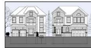
2 STREETSCAPE - LOTS 6-7 SPT 1:250