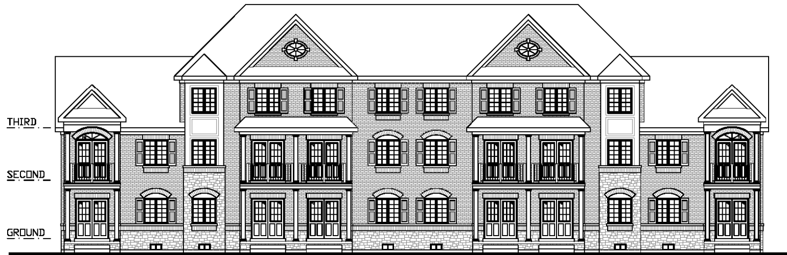
BLOCK ELEVATION FACING KING ROAD