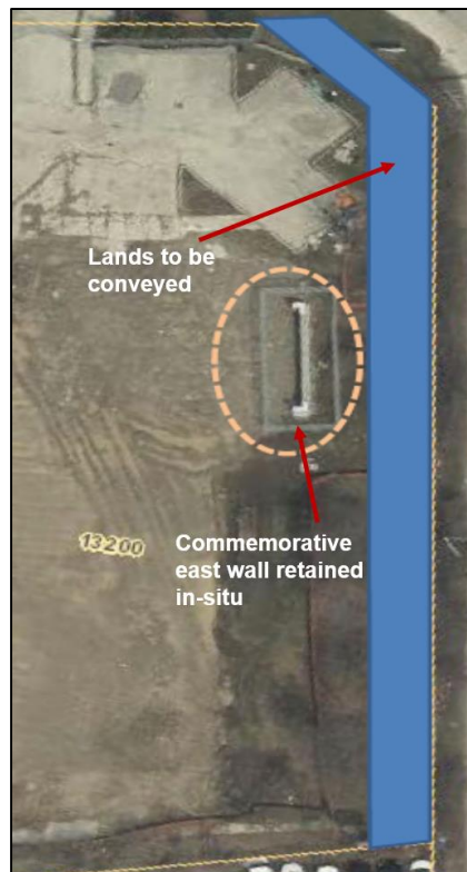
Detail of subject property showing lands to be conveyed.

In light of the requirements by the Region of York for development approval, the applicant, the Académie de la Moraine, is requesting an amendment to the Designating By-law. It is now appropriate to exclude the areas that are to be conveyed to the Region of York.