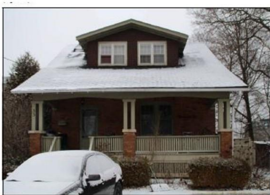
Original Front Elevation