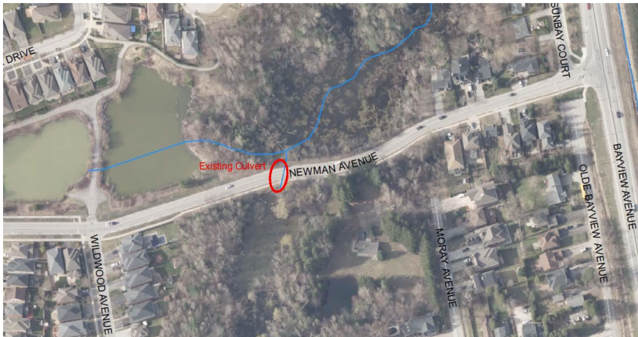
Figure 2 – Newman Avenue culvert location