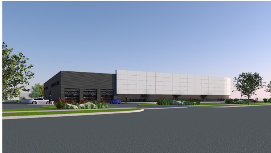
Orlando Avenue Elevation - Dealership "A"