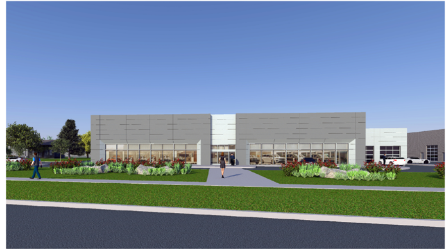
Leslie Street Elevation - Dealership "B"