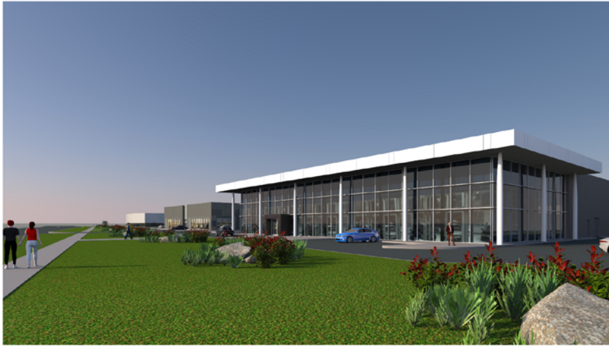
Leslie Street Elevation - Dealership "C"