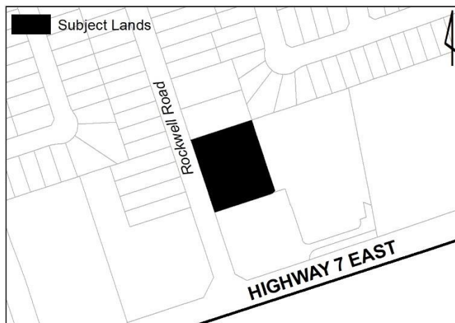
Map 2. Location of Pte. Thomas Armstrong Millar Park