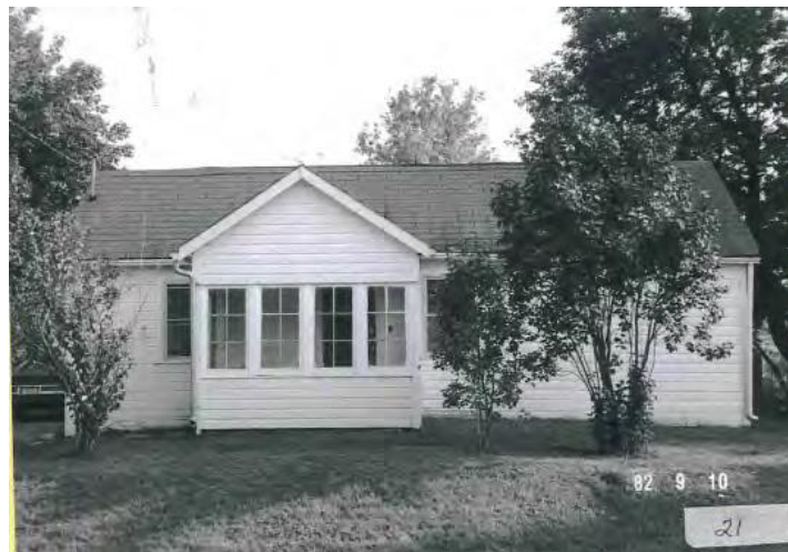
North Elevation -19 Aubrey Avenue (Richmond Hill LACAC File)

19 Aubrey Avenue contains limited design value. The structure was designed to be a simple, efficient and economical one-bedroom house. This design intent is reflected in the overall simplicity of the structure with its basic rectangular plan with gable-roofed front porch and Dutch-style lapboard siding. Staff concurs with the CHIA's assessment that the structure is not a rare, unique or early example of its type and standard materials and construction methods were used. Overall, it does not exhibit a high degree of artistic merit either in its craftsmanship or in its design.