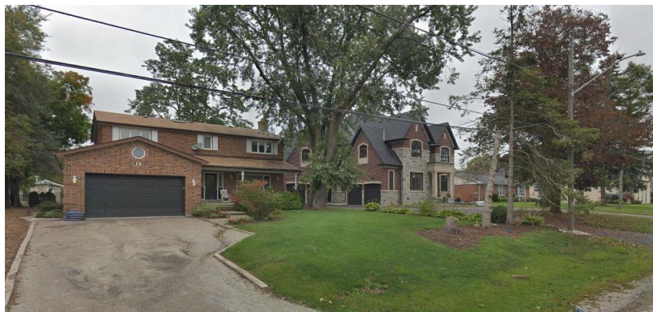
Current context of the neighbourhood (Google Map)

Contextual value is met if a building is important in defining, maintaining or supporting the character of an area. Alternatively contextual value could be met if the property is physically, functionally, visually or historically linked to its surrounding.