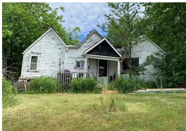
South Elevation -19 Aubrey Avenue (Somerville Planning)