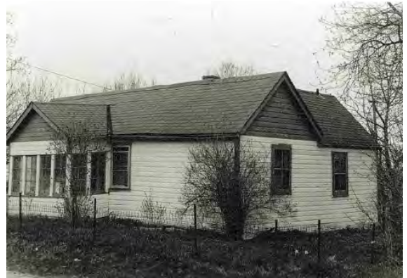
1970s Photo of 19 Aubrey Avenue