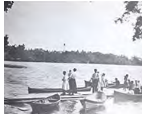
Summer on Lake Wilcox

The creation of these improved transportation links along Yonge Street increased development pressure along the corridor. By 1914 a number of Plans of Subdivision had been approved along the west side of Yonge Street. These developments were much more suburban in design than the earlier cottage developments around Lake Wilcox. However, it wasn't until after the first World