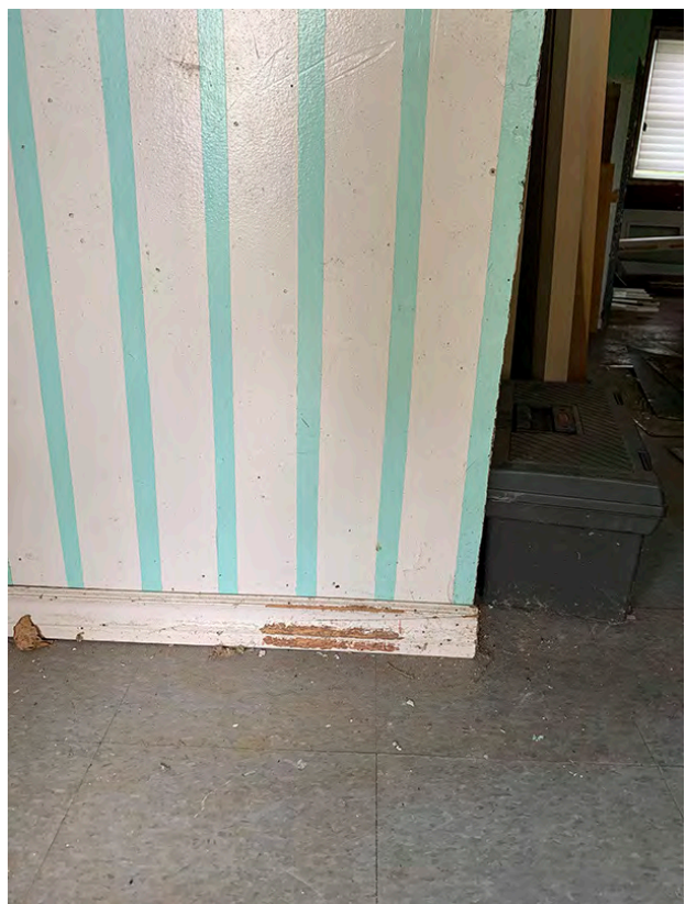
Floor Trim Detail