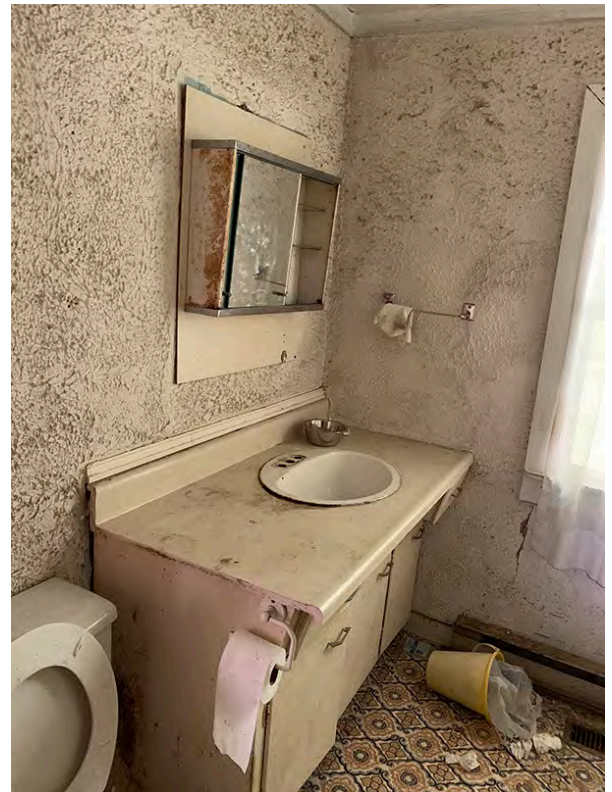
Bathroom/Laundry Room