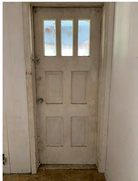
Front Door of 19 Aubrey Avenue