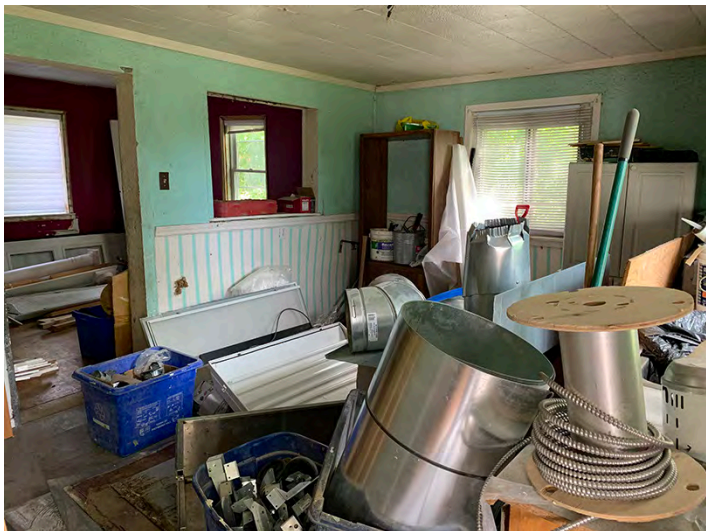
View between Kitchen and Living Room