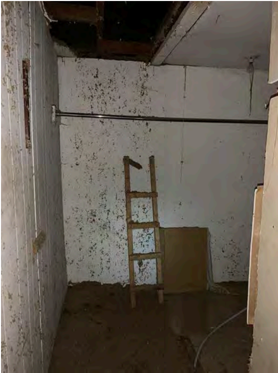
Interior Mechanical Room off of Front Hall