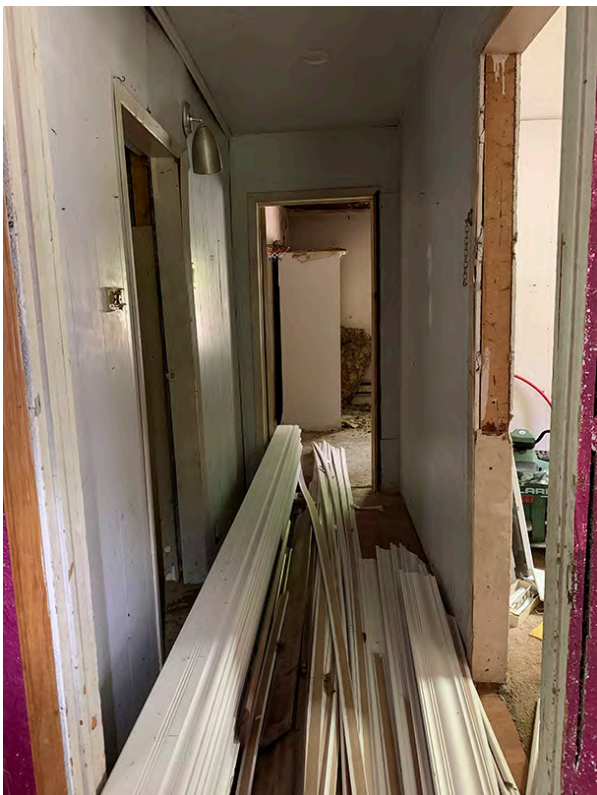
Front Hall Leading to Bedroom