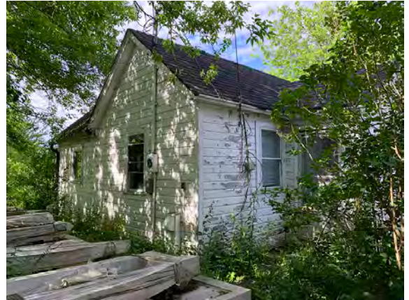
Perspective view of 19 Aubrey Avenue

In order for a property to be considered a candidate for associative historical value a strong connection must be established between an activity or person of historical significance and the subject property. Alternatively, the property could be considered for designation if a significant event occurred at the site.