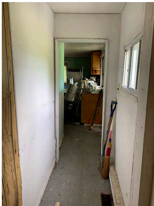
Back Hall Leading to Kitchen