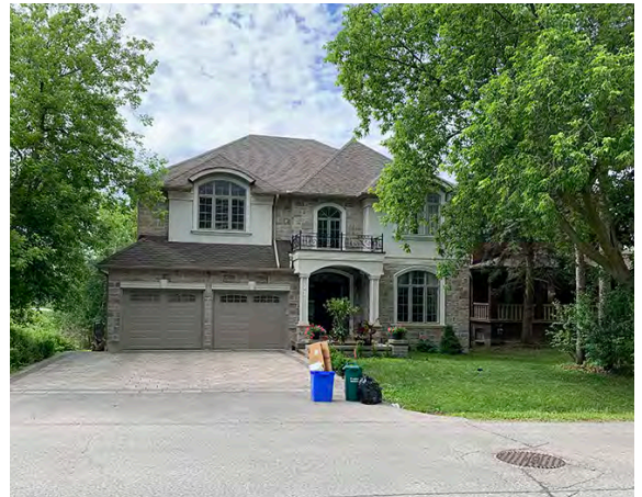
Street view of 21 Aubrey Avenue