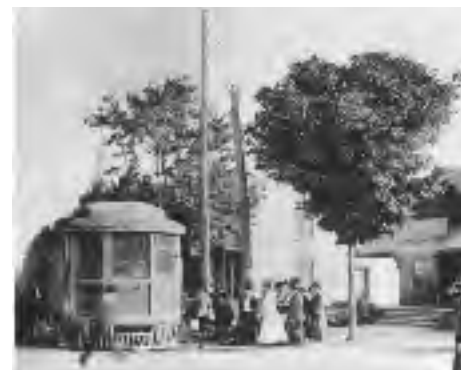
Metropolitan Street Railway