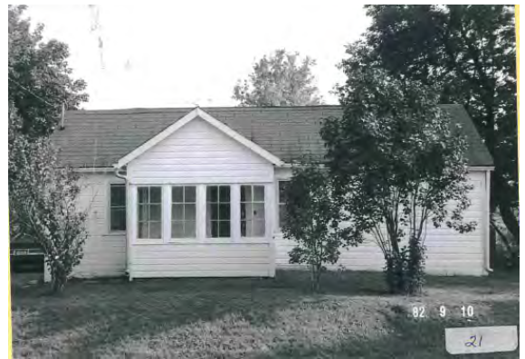
North Elevation - 19 Aubrey Avenue

The subject property consists of a c.1924, one-storey, vernacular designed house completed in wooden Dutch-style lapboard and includes an enclosed front porch with a one-storey gabled rear addition. The house is of a simple design and was originally intended to provide economical accommodation in an efficient layout. In keeping with the economical design intent there is no basement or extraneous design elements.