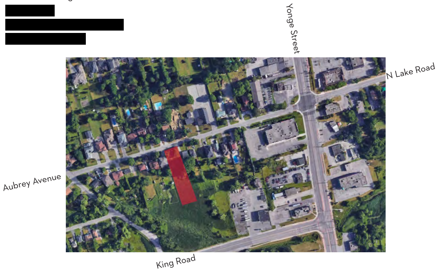
Context Image of 19 Aubrey Avenue, Highlighted in Red (Google Earth)