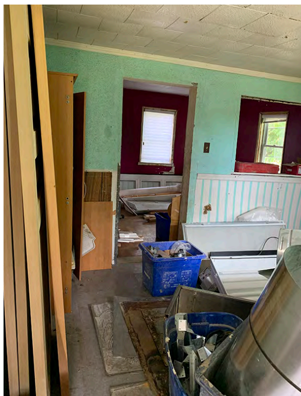
View between Kitchen and Living Room