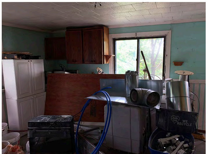
Rear Kitchen