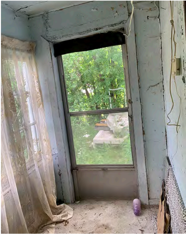
Entrance Porch