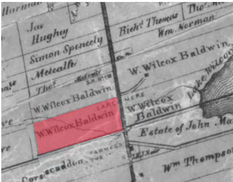
Location of Lot 66-1 (Source: Historical County Map of York County, Tremain Map, 1860)