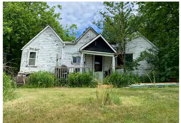
South Elevation - 19 Aubrey Avenue

From the Aubrey Avenue elevation the house presents a simple rectangular form with an enclosed front entry porch asymmetrically located at the centre of the house. From the rear of the house the design presents three south facing gables with an asymmetrically located rear door in the middle. It is likely that the rear of the house was altered at a later date, however no information could be found that would specify a date. Both the original house and later addition are completed in white Dutch-style lapboard. Overall, the structure is unremarkable as an example of Ontario vernacular cottage design as the structure does not exhibit any reference to common styles such as the Craftsman style or contain a high degree of craftsmanship.