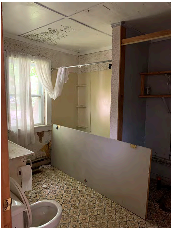
Bathroom/Laundry Room