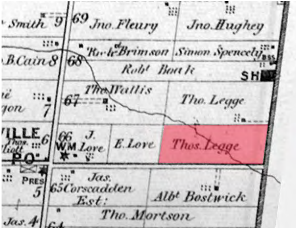
Location of Lot 66-1 - Thomas Legge Ownership

The lure of the Oak Ridges area as a place for relaxation and escape from the noise and dirt of the city only grew throughout the 19th and 20th century. Lake Wilcox to the east of Yonge Street was the centre of this development which included a hotel and amusement grounds as well as numerous cottages. The growth of development led to an increase in transportation connections to nearby areas. In 1899 the Metropolitan Street Railway Company which ran along Yonge Street extended service of its electric trains north from Toronto to Oak Ridges, Aurora and Newmarket. This service was complemented by the development Schomberg and Aurora Railway (1902-1927), the terminus of which was located in the heart Oak Ridges at King Road and Yonge Street).