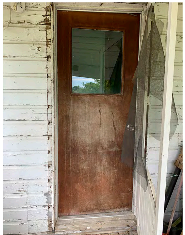
Rear Door Leading to Back Hall