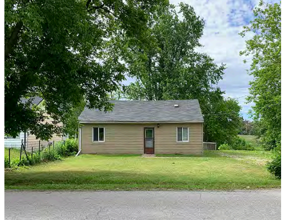
Street view of 17 Aubrey Avenue

After considering the subject property through a historical contextual lens, it is the opinion of the consultant that 19 Aubrey Avenue cannot be considered of significant contextual heritage value.