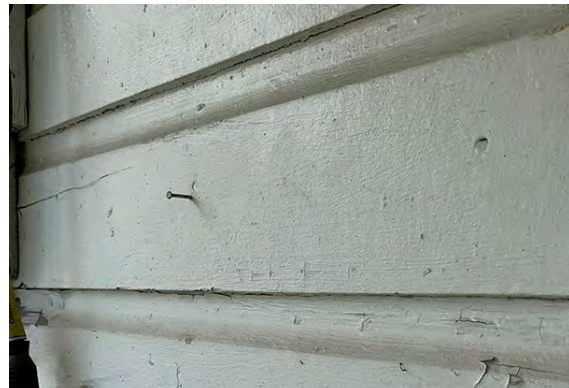
Dutch-style Lapboard

larger bathroom, second bedroom and larger kitchen. The consultant undertook a site visit on June 25, 2020 which included a review of the interior condition (See Appendix “C”). The review found no interior design elements of value or interest.