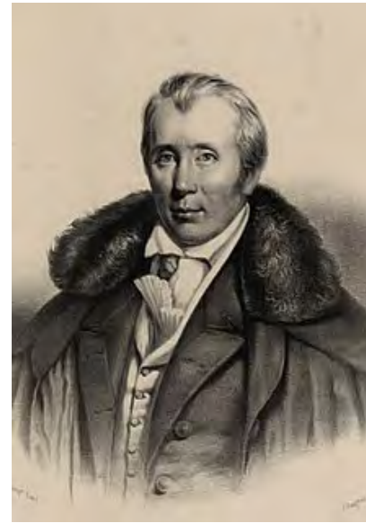
William Warren Baldwin (1775-1844)