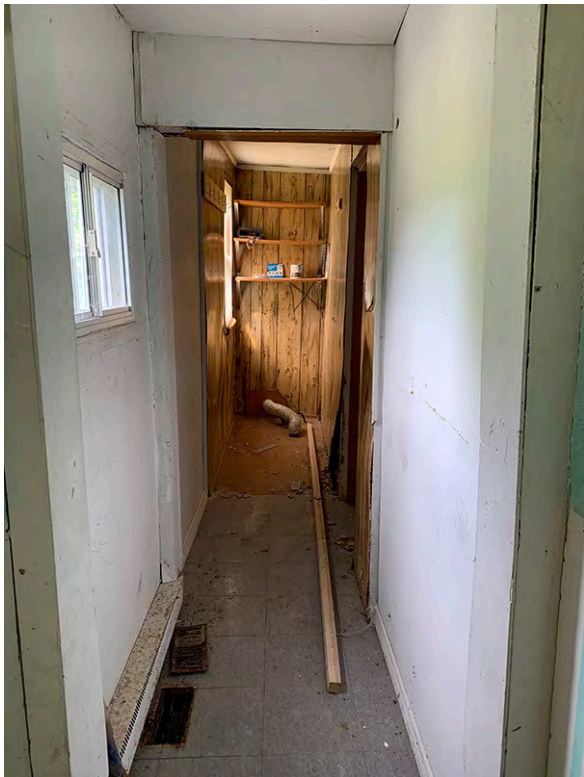
Back Hall Leading to Bathroom