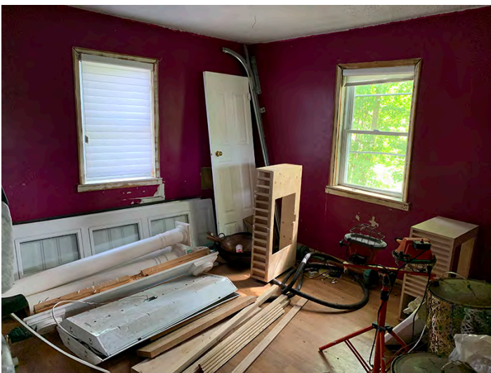
Front Living Room