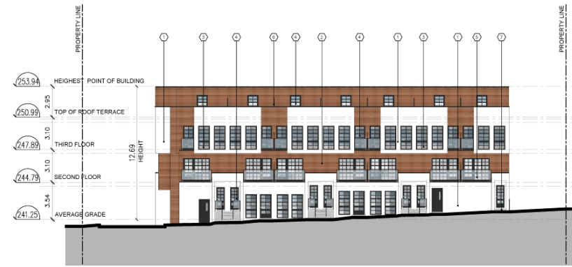
02 EAST ELEVATION 1:150