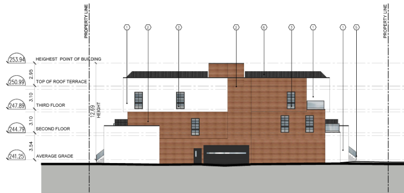
03 SOUTH ELEVATION 1:150