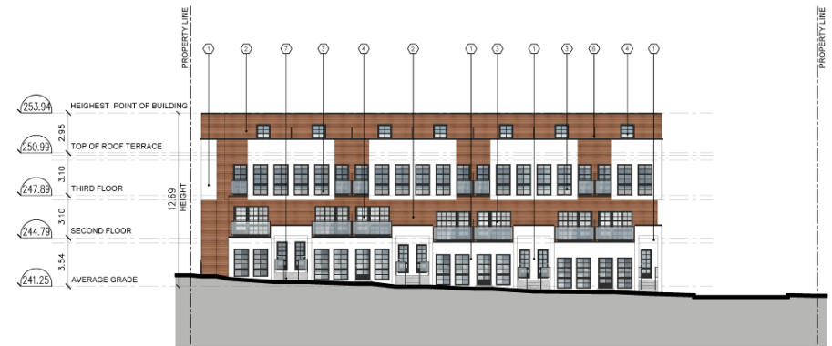
04 WEST ELEVATION 1:150