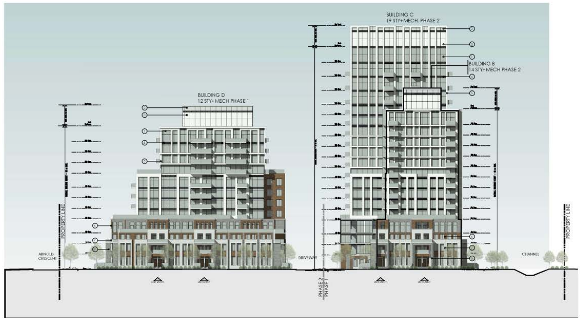
BUILDING B, C AND D NORTH ELEVATION