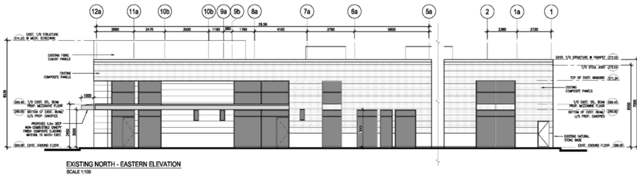
EXISTING NORTH - EASTERN ELEVATION SCALE 1:100