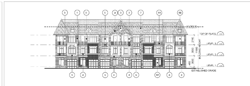
Building I, J & K Front Elevation 1 : 150 5 RZ-18