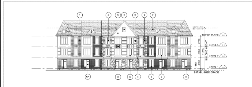
Building B & H Rear Elevation 1 : 150 6 RZ-17