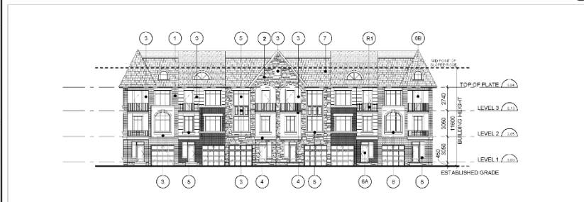
Building B & H Front Elevation 1 : 150 5 RZ-17