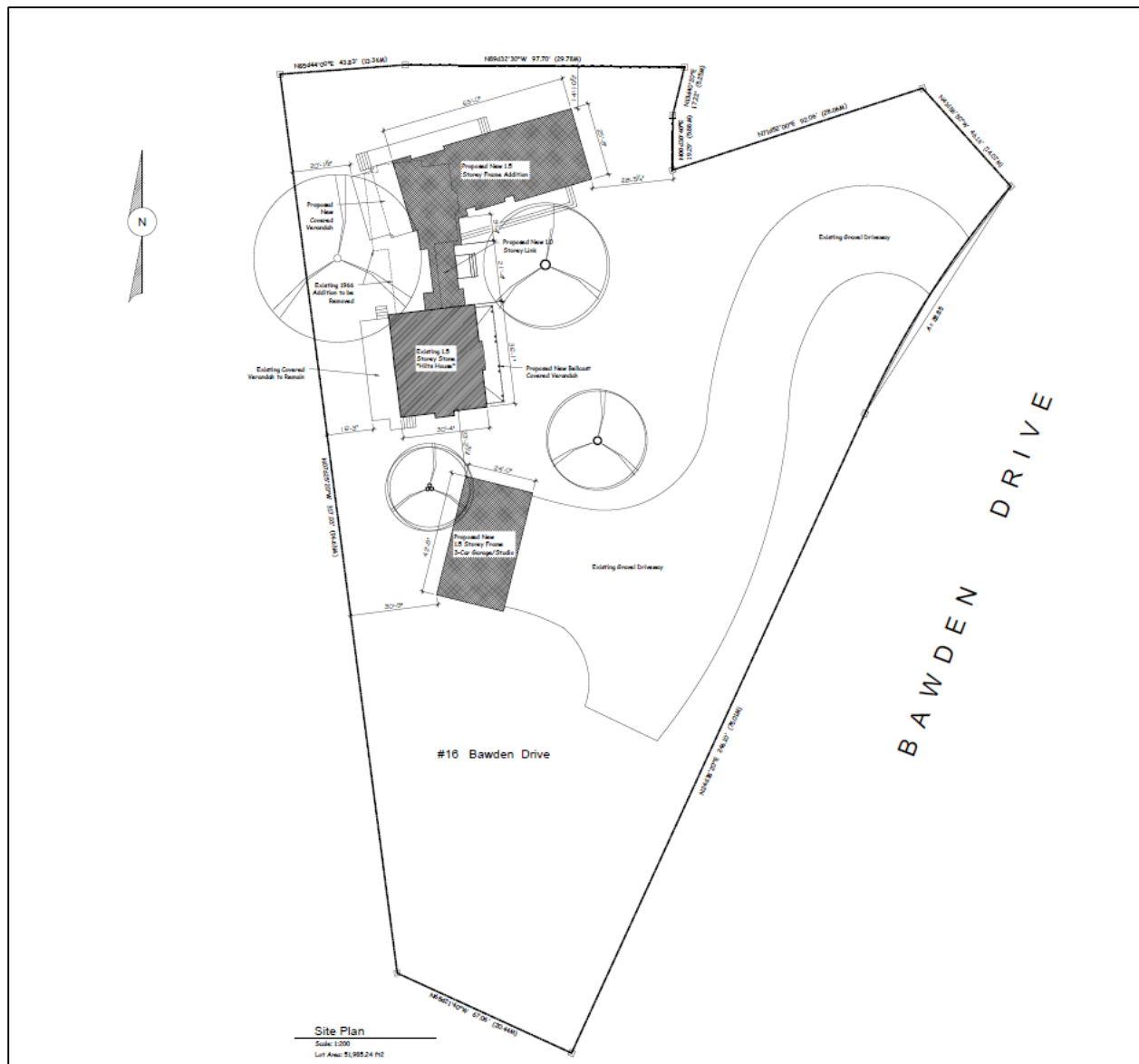
Figure 2: Site plan showing the location of the proposed new garage to the south of the existing house.