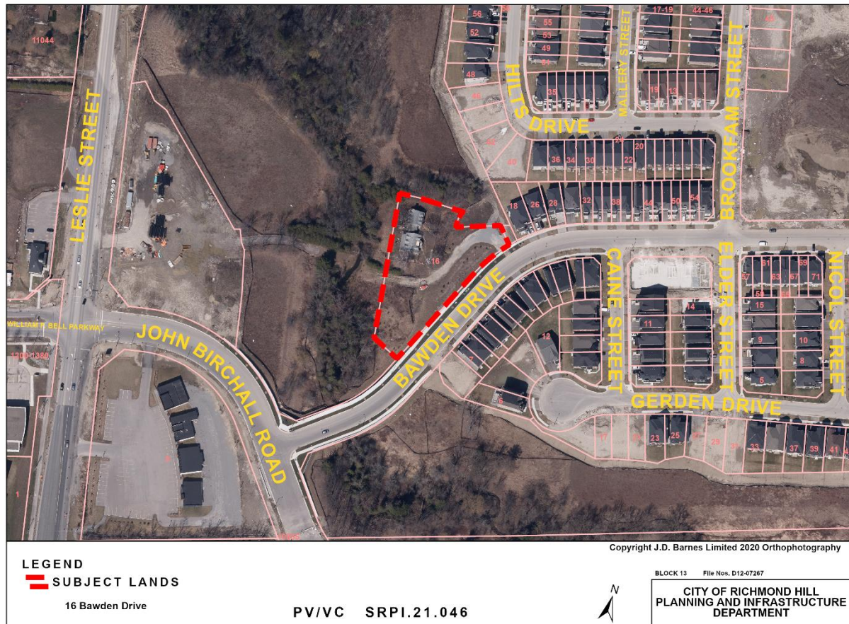
MAP 1 - AERIAL PHOTOGRAPH