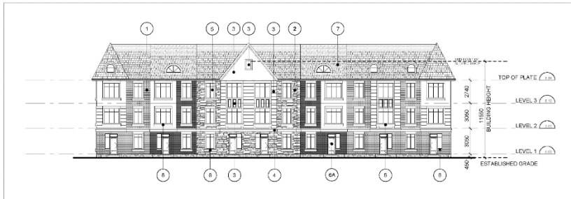
Building G Rear Elevation 6 1 : 150 RZ-19