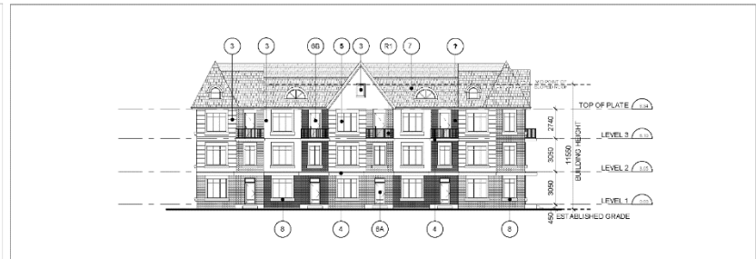
Building C & E Rear Elevation 6 1 : 150 RZ-20