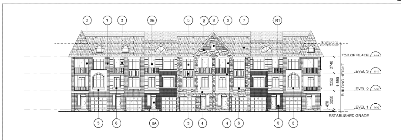
Building G Front Elevation 5 1 : 150 RZ-19