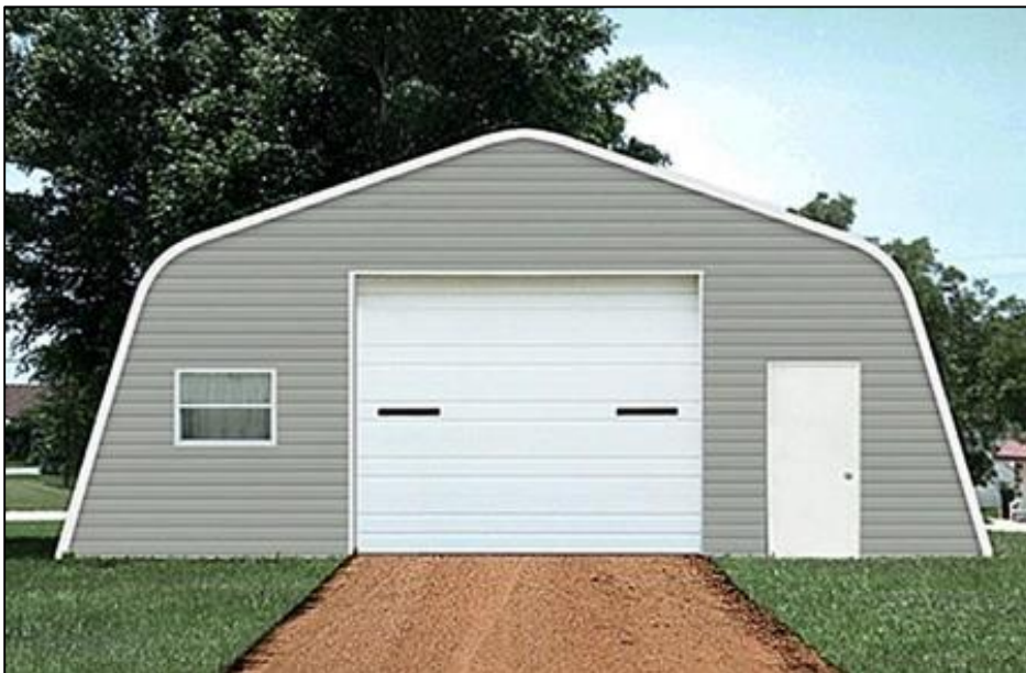
Figure 3: Example of the type of front façade the owner wishes to add to the metal structure (image provided by the owner).