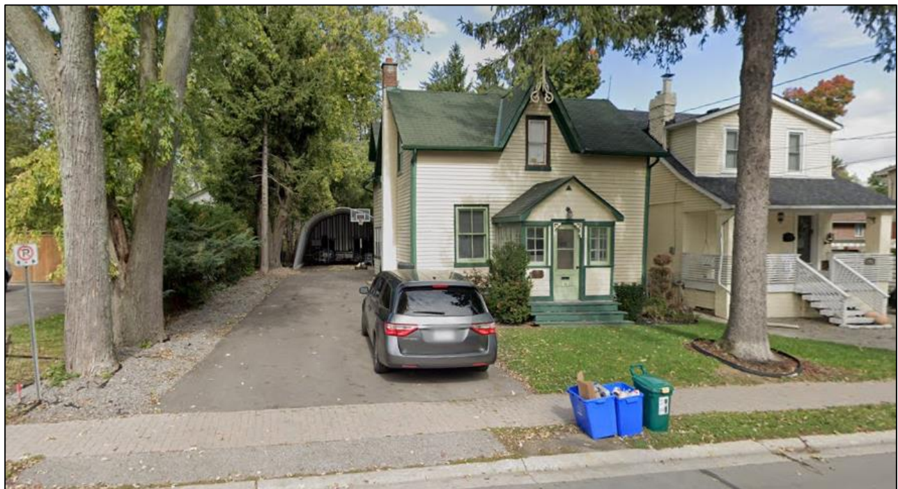
Figure 1: View of the Subject Property north from Richmond Street. The metal structure can be seen to the rear of the house.

The utility structure is located at the end of the driveway near the western boundary of the Subject Property, and is located to the west and partially behind the Eliza Gaby House. A row of mature trees is located to the west of the metal structure (see Figure 1).