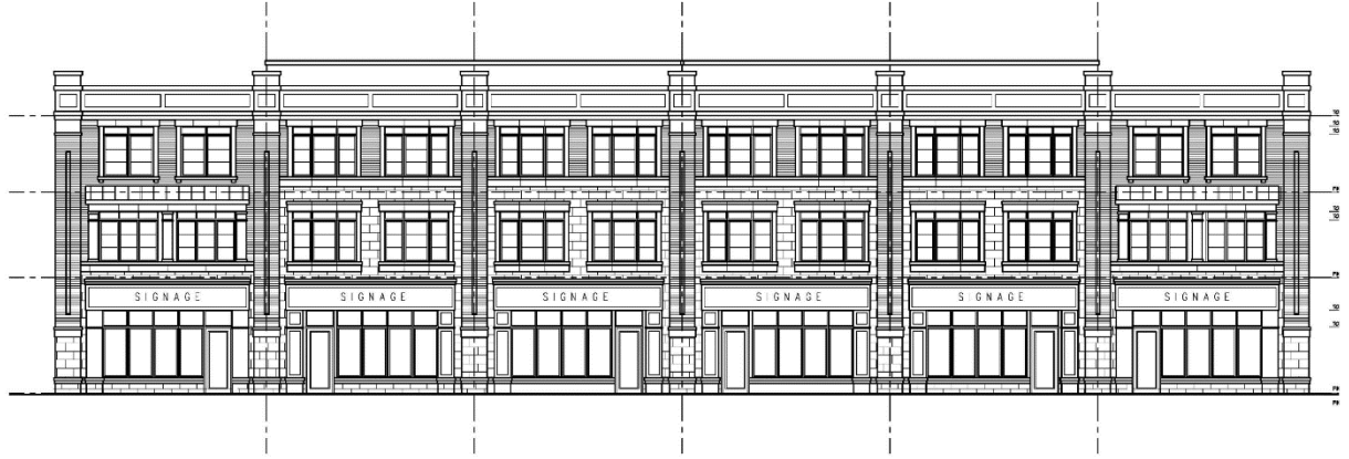
FRONT ELEVATION (TYPICAL 7.5m LIVE/ WORK TOWNH)