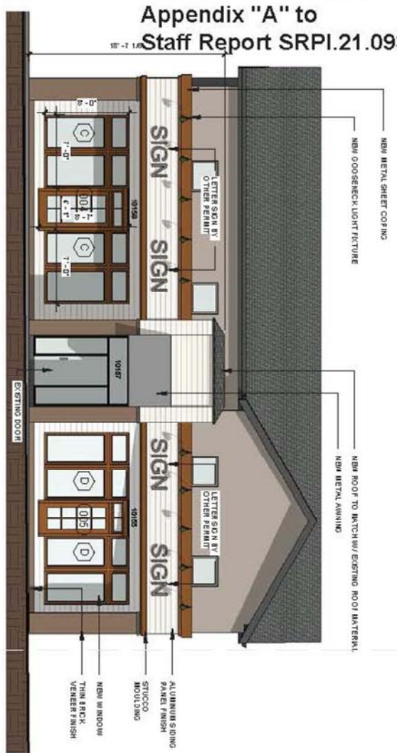
1 WEST ELEVATION 1/8" = 1'-0"