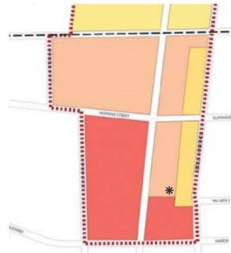
Height - Civic District