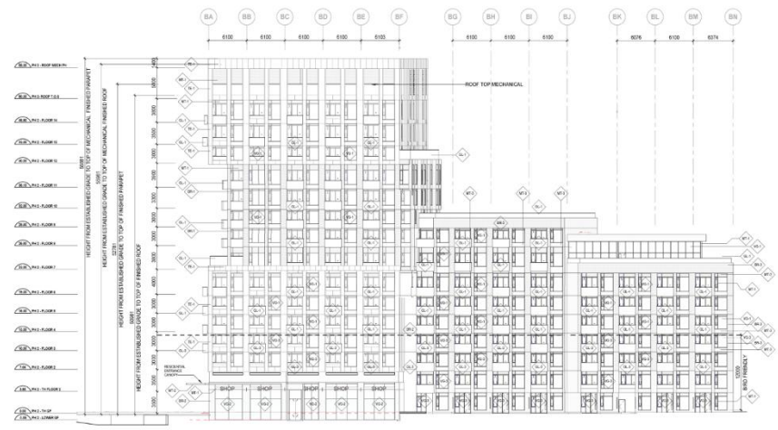
Phase 2 Building B - South Elevation