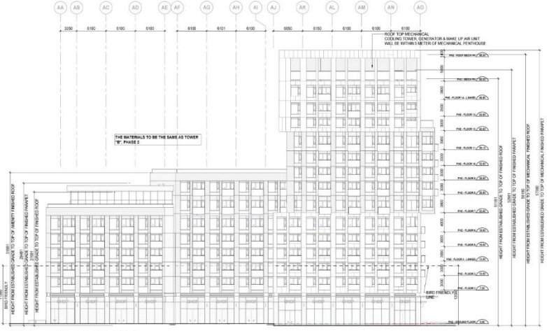
Phase 3 Building A - South West Elevation