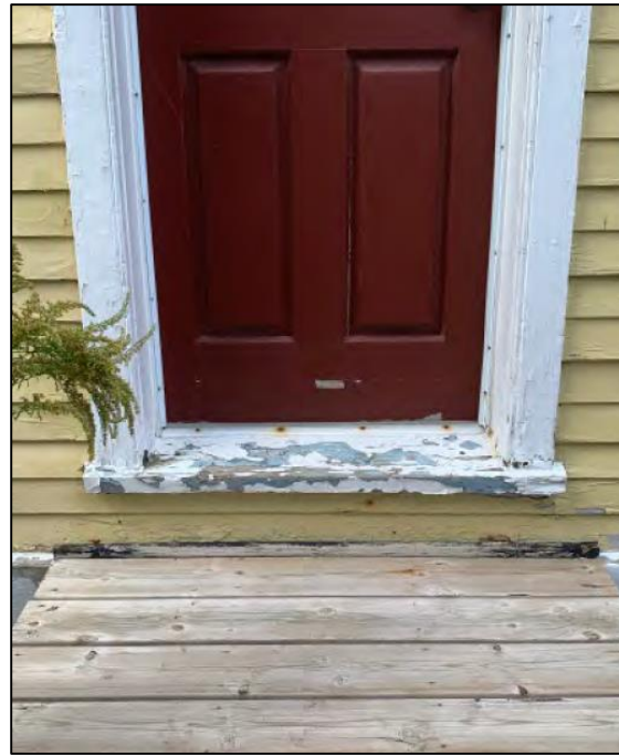
Figures 1 and 2: Photographs of the east elevation showing portions of the wooden siding and skirting board that require repairs and repainting, as well as climbing vines that are to be removed (left), and a door sill that requires repainting.