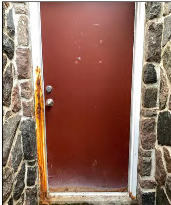
Figures 3 and 4: Photographs of a window with missing muntins (left), and of the basement door with a rusted frame (right).