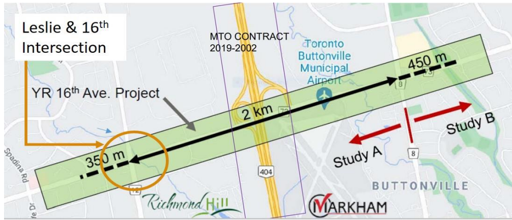
Diagram 1. Extent of the 16<sup>th</sup> Avenue Reconstruction Project

Highway 404 along 16<sup>th</sup> Avenue, marking the easterly entry to Richmond Hill from Highway 404 (Diagram 1).