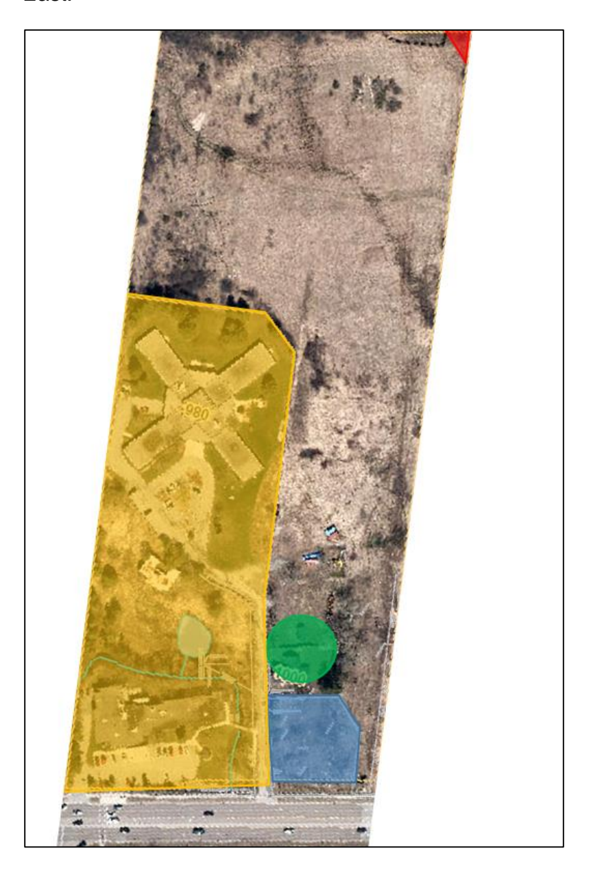
Figure 1: Aerial photo identifying the location of the property's heritage attributes (in green), lands to be conveyed as a Natural Heritage System (in blue), lands to be conveyed for road allowance (in red), and the lands now known as 980 Elgin Mills Road East (in yellow).

cause physical or visual impacts to the cultural heritage value of 1000 Elgin Mills Road East.