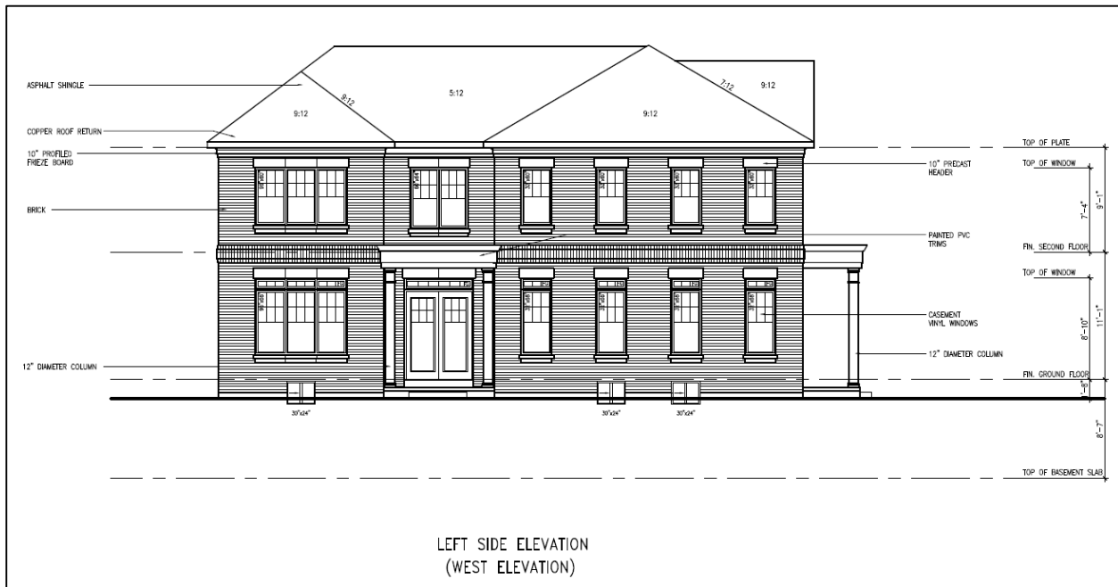
Figure 2: West elevation of the proposed replacement building.