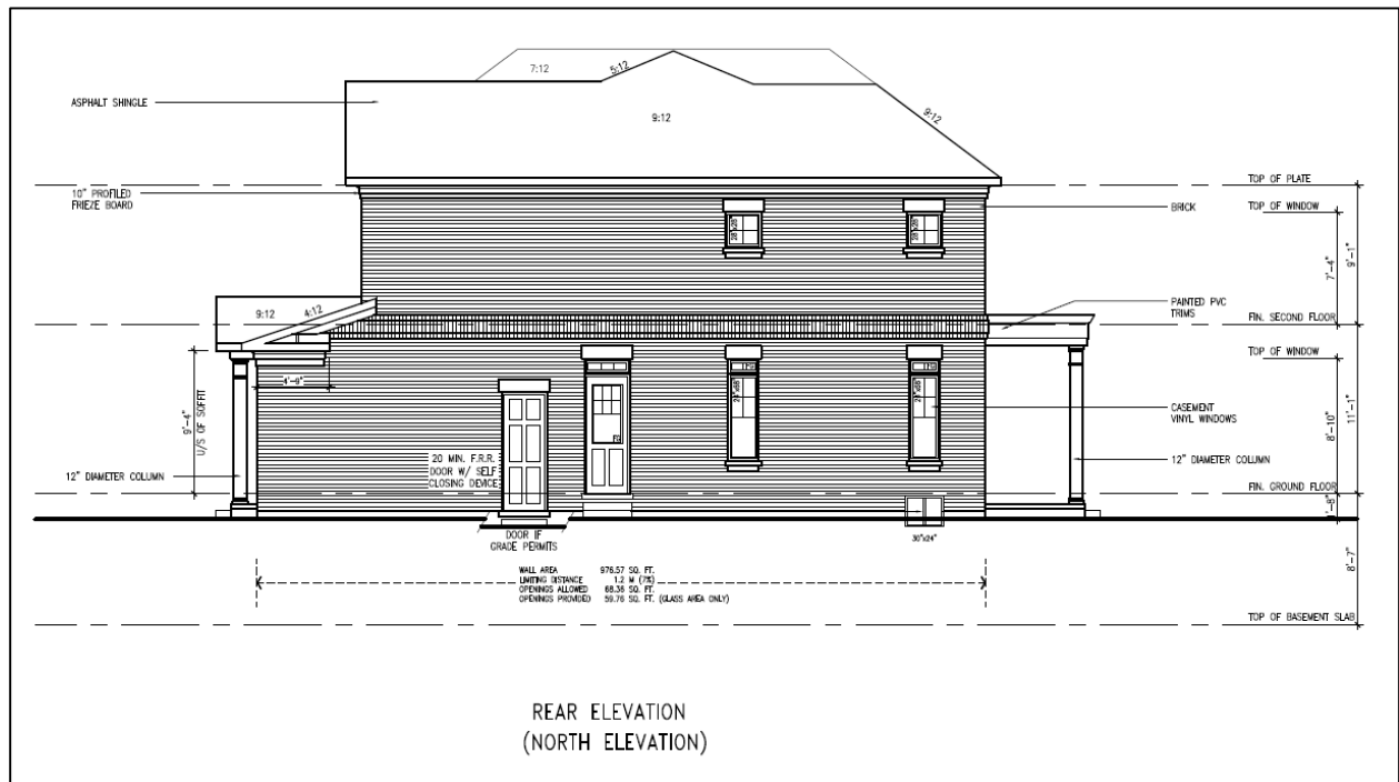
Figure 4: North elevation of the proposed replacement building.