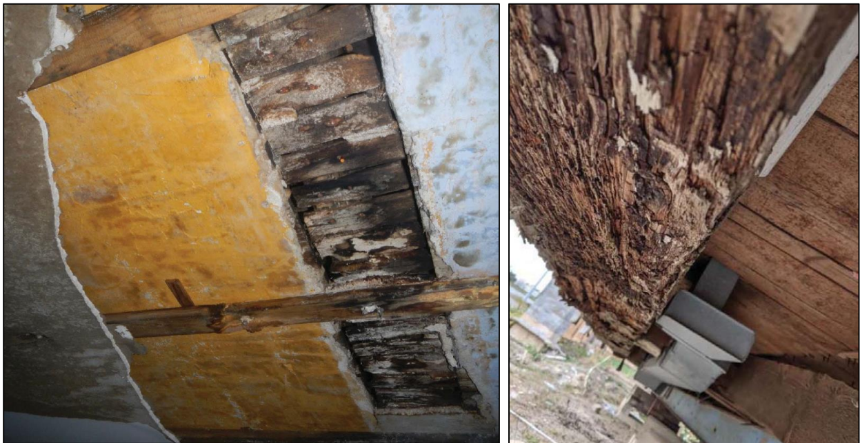
Figures 6 and 7: Photo of second floor ceiling showing water damage and mold (left), and decayed south sill beam and failed adjacent floor joist.