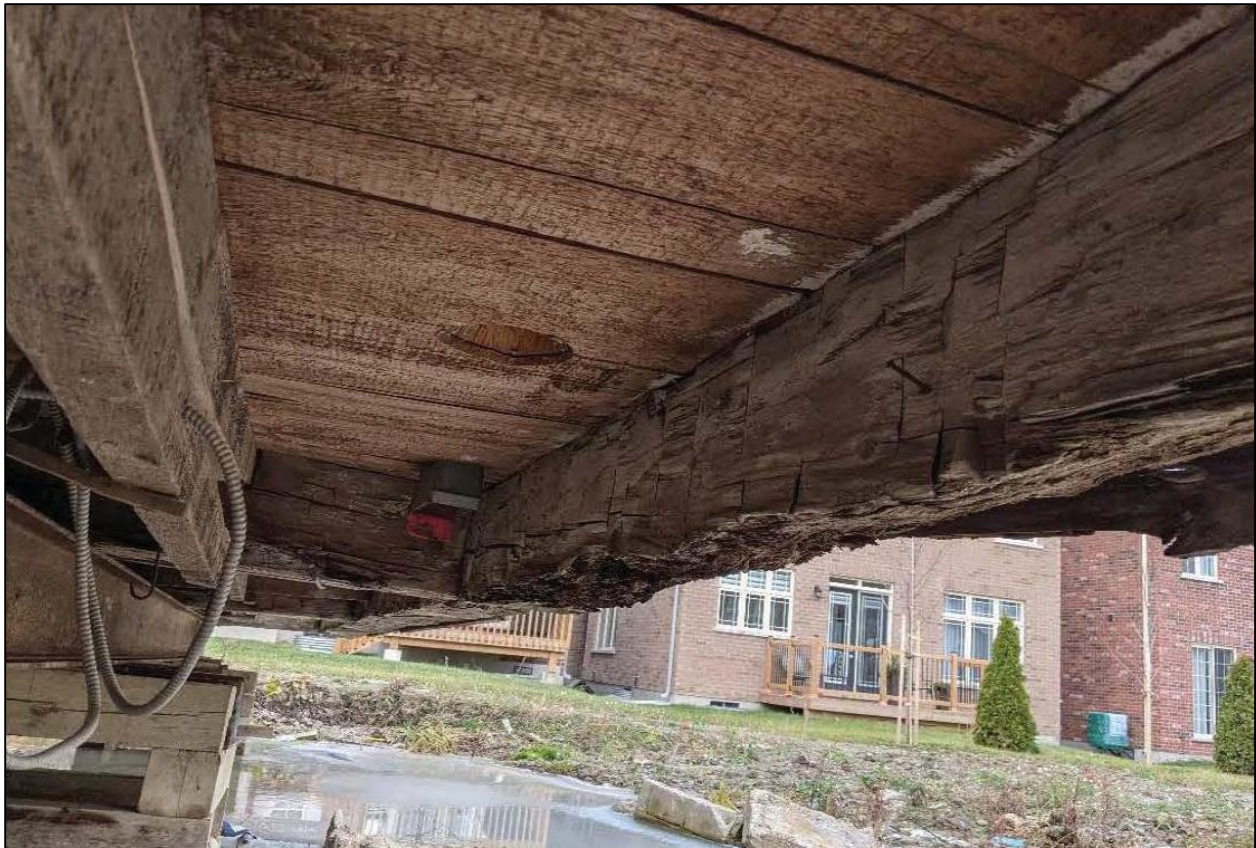
Figure 5: Photo of decayed north sill beam and failed adjacent floor joist