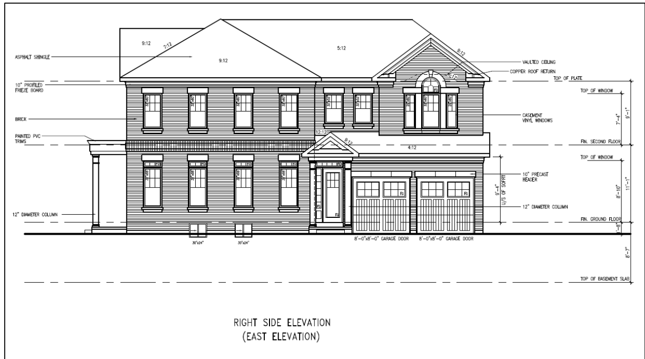
Figure 3: East elevation of the proposed replacement building. This façade would face Greywacke Street.