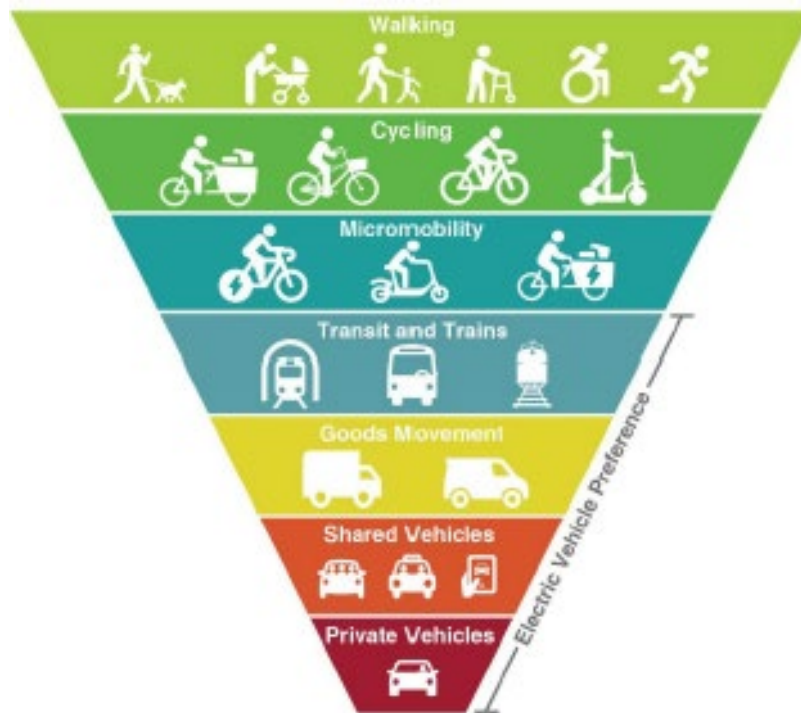
Figure 1: City Proposed “Mobility Hierarchy”