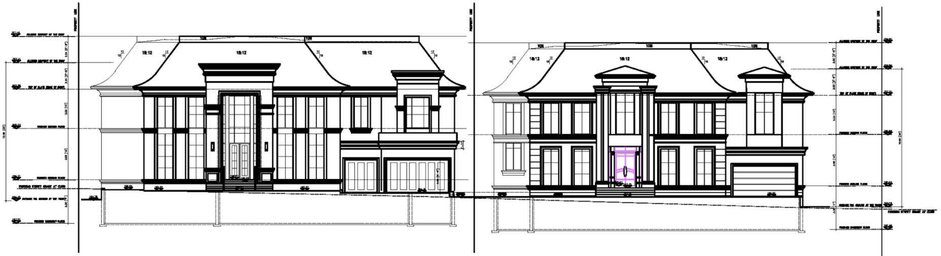
DENHAM DRIVE STREET VIEW