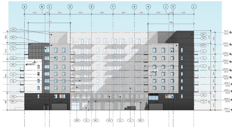
1 EAST ELEVATION SCALE: 1/200