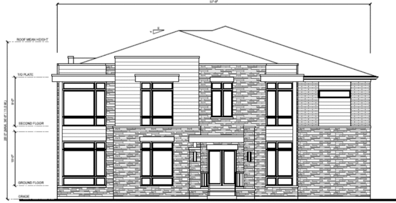
FLANKAGE ELEVATION 'A'