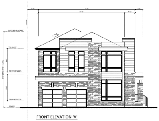
FRONT ELEVATION 'A'