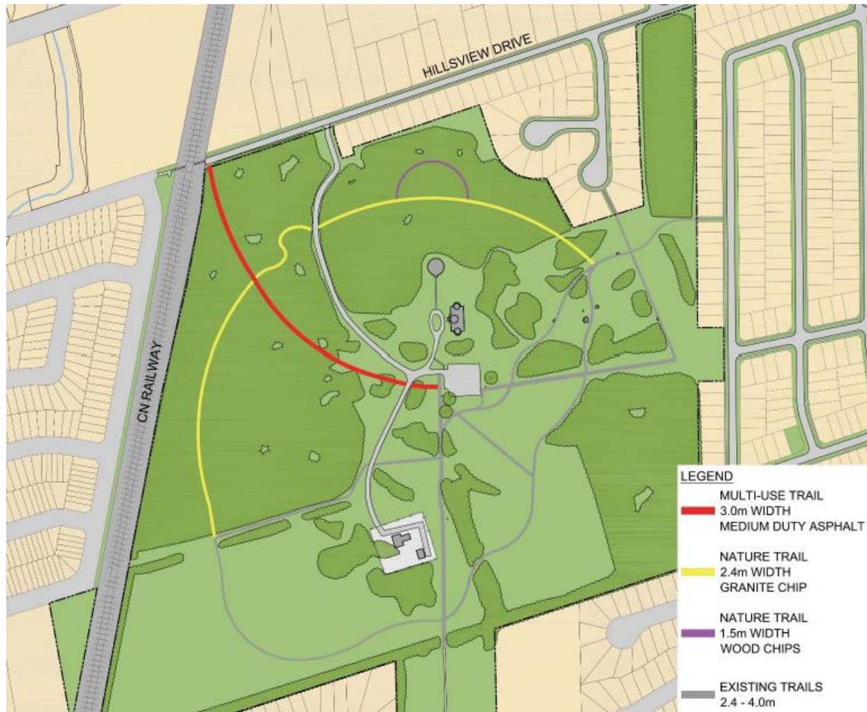
Figure 1 Proposed Multi-Use Path (red) and Nature Trails (yellow and purple)

The proposed trails will range from 1.5 to 3.0 metres wide, in addition to safety buffers for trail users. The trails will also be paved in a variety of materials, determined by site conditions and anticipated uses. Please refer to Figure 1 for further information on the MUP and Nature Trails.