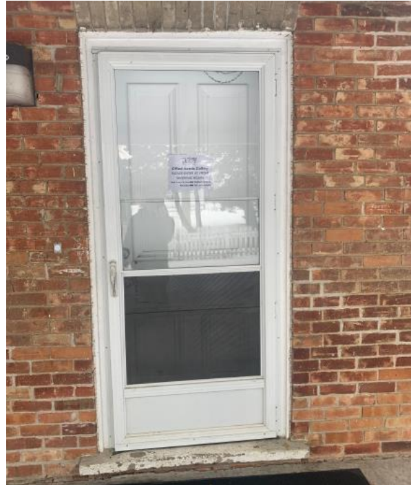
Figure 2 Front (left) and secondary (right) entrances at the Thomas F. Boynton House, showing areas of peeling paint and damaged wooden doorsills, to be replaced in kind.