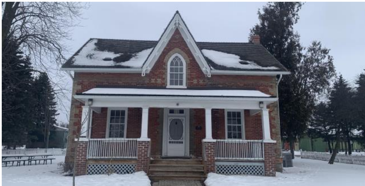
Figure 1 Front (south) elevation of the Thomas F. Boynton House at 1380 Elgin Mills Rd E