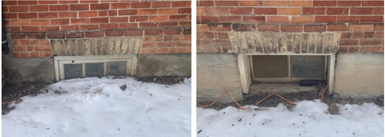
Figure 3 Typical basement windows at the Thomas F. Boynton House's west (left) and east (right) elevations, showing damaged wooden frames and concrete sills, and need for re-grading.