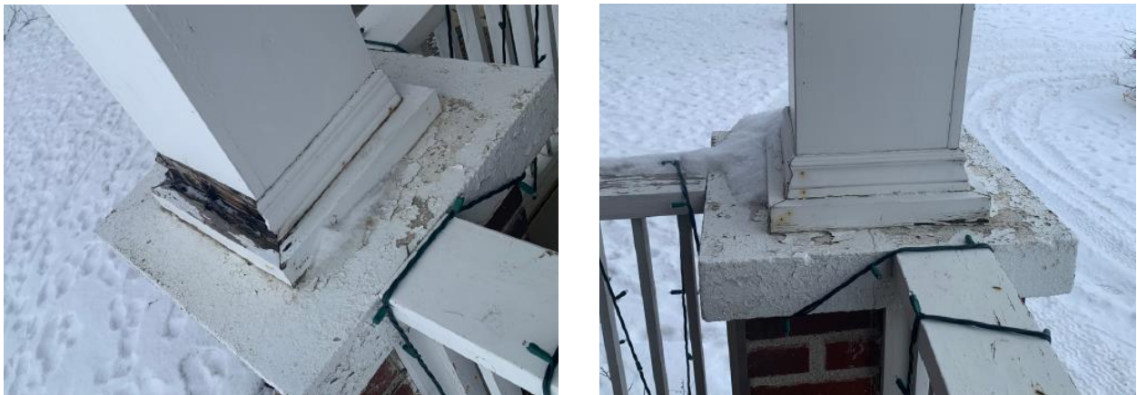
Figure 4 Detailed view of the damaged base trim and peeling paint at the Thomas F. Boynton House's west (left) and east (right) front porch columns.