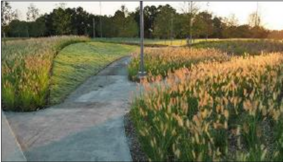
Figure 2: Design Concept illustrating approach to intersection corner enhancements.