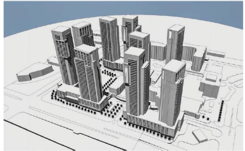
AERIAL VIEW From SOUTHEAST