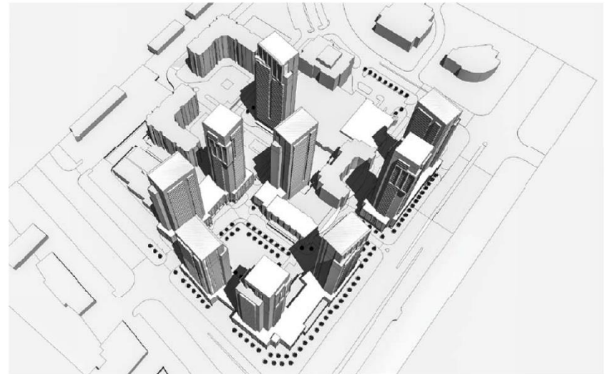
BIRDSEYE VIEW From SOUTHWEST

600 and 650 Highway 7 East, and 9005 Leslie Street