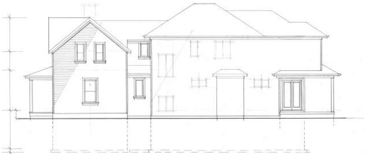
Figure 6 East elevation of the Eliza Gaby House, showing the conserved front portion of the house (left) and proposed rear addition (right) (Source: The Gregory Design Group).