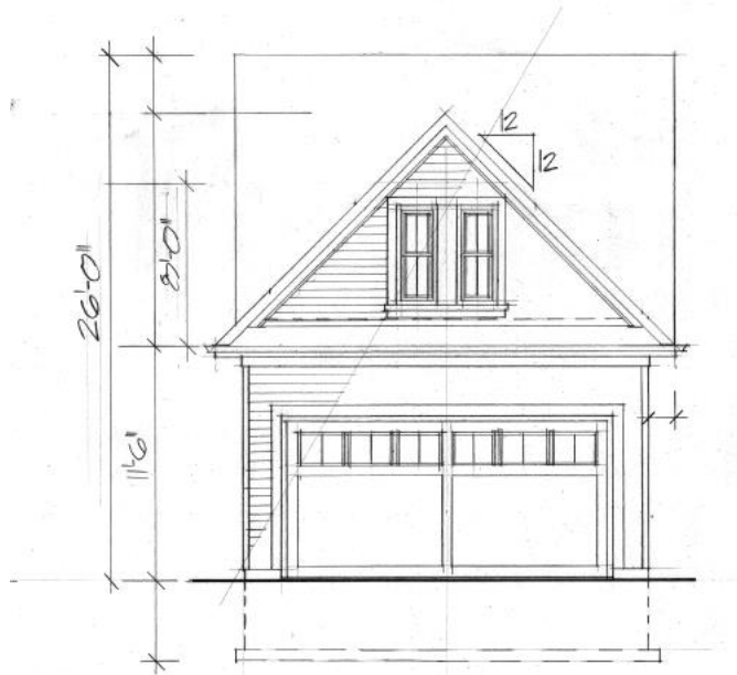
Figure 8 South elevation of the proposed rear detached garage, which will replace the existing unsympathetic temporary steel garage.