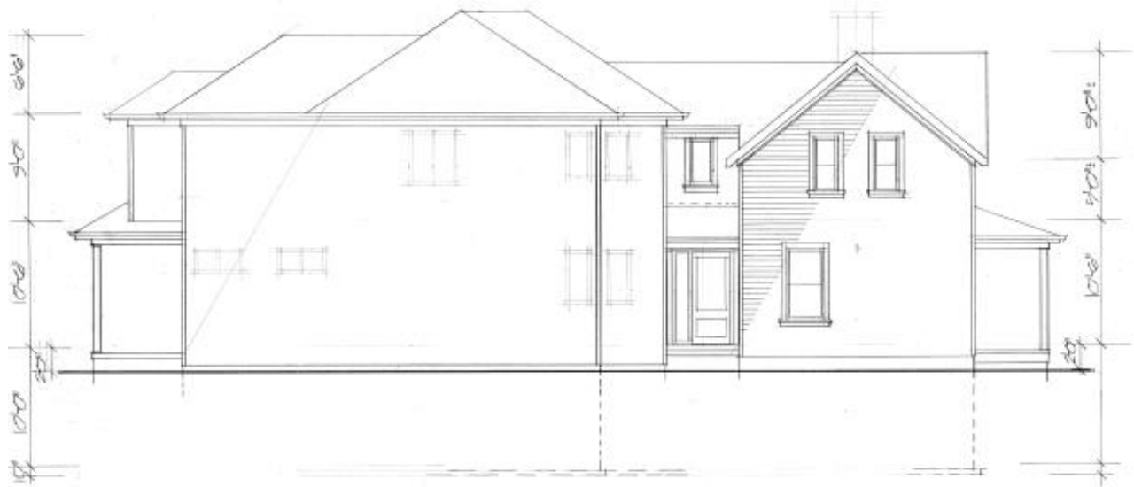
Figure 7 West elevation of the Eliza Gaby House, showing the conserved front portion of the house (right) and proposed rear addition (left) (Source: The Gregory Design Group).