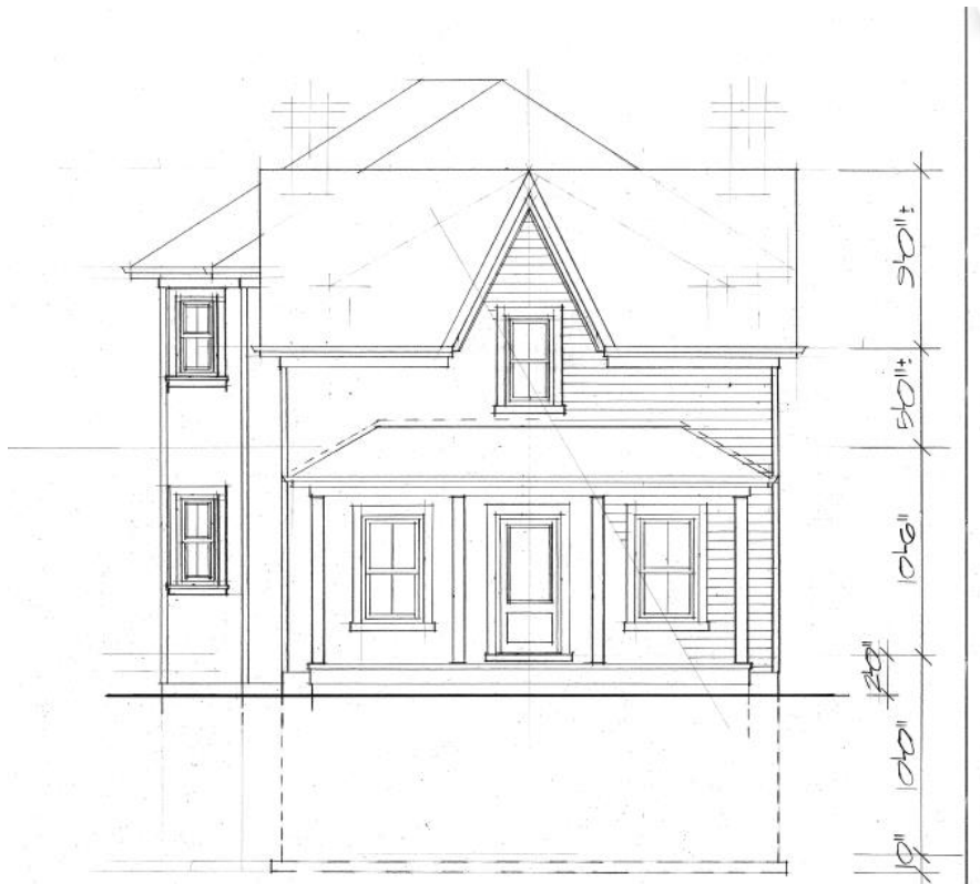
Figure 5 South elevation of the Eliza Gaby House, showing the conserved front portion of the house and the proposed rear addition (Source: The Gregory Design Group).