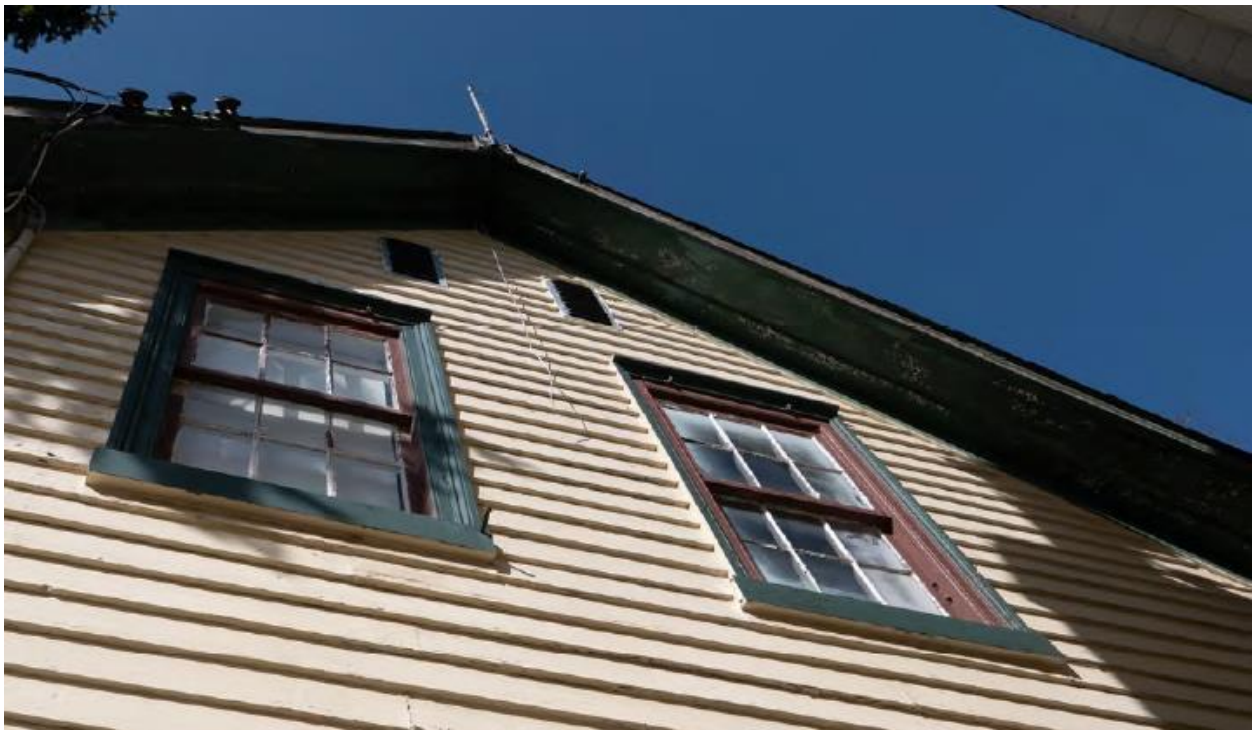
Figure 4 Photograph of two of the original 6-over-6 sash windows on the east elevation of 103 Richmond Street