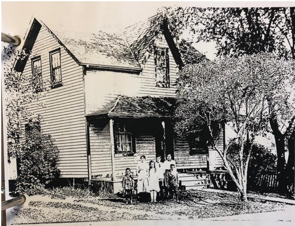
Figure 3 Early 20 th century photograph of the house at 103 Richmond Street, showing the historic open front porch