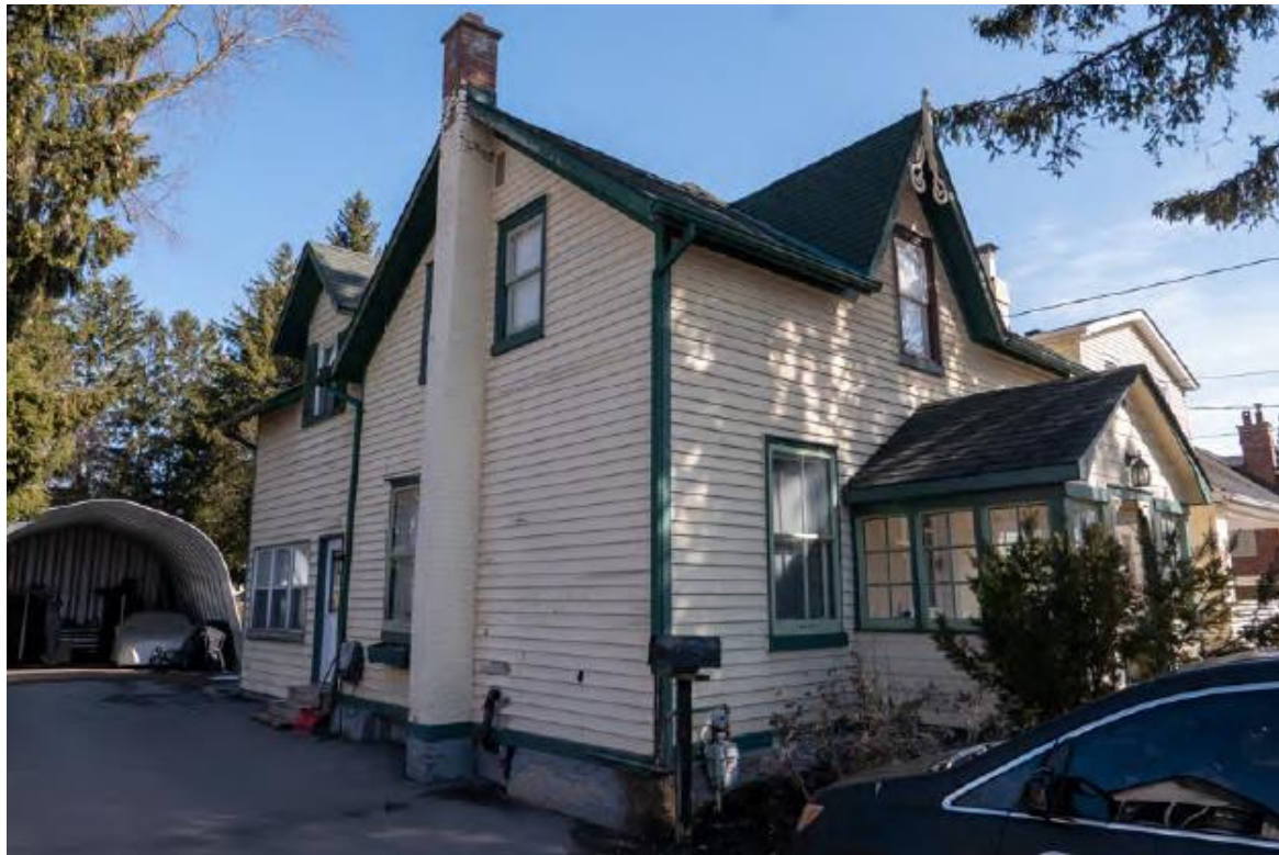
Figure 1 View northeast of the dwelling at 103 Richmond Street, showing the main (south) portion with non-original enclosed front porch in the foreground, rear (north) extension/addition in the background, and temporary steel garage structure on the far left

A temporary steel garage structure is also located at the rear of the property, to the northwest of the heritage house.