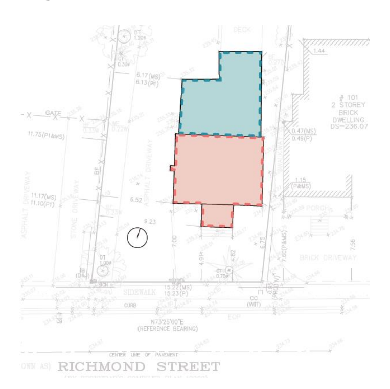
Figure 2 Diagram showing the main (south) portion of the Eliza Gaby House in red, and the rear (north) extension/addition in blue.