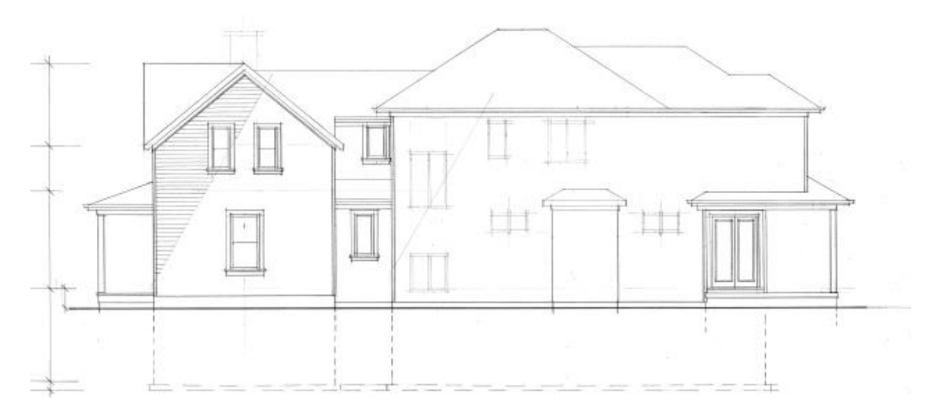
Figure 6 East elevation of the Eliza Gaby House, showing the conserved front portion of the house (left) and proposed rear addition (right) (Source: The Gregory Design Group).

Figure 5 South elevation of the Eliza Gaby House, showing the conserved front portion of the house and the proposed rear addition (Source: The Gregory Design Group).