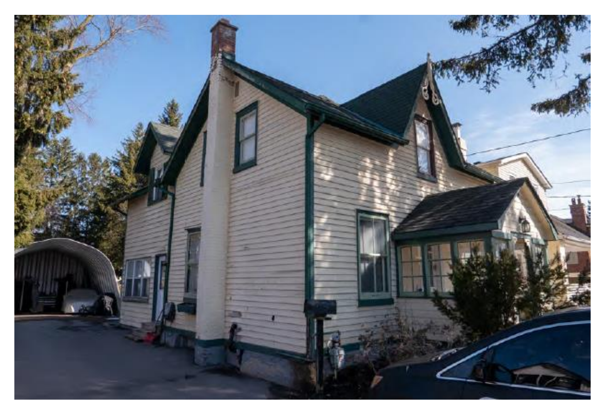
Figure 1 View northeast of the dwelling at 103 Richmond Street, showing the main (south) portion with non-original enclosed front porch in the foreground, rear (north) extension/addition in the background, and temporary steel garage structure on the far left

A temporary steel garage structure is also located at the rear of the property, to the northwest of the heritage house.