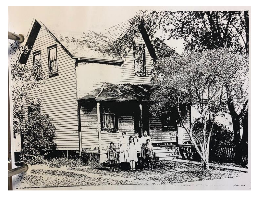
Figure 3 Early 20<sup>th</sup> century photograph of the house at 103 Richmond Street, showing the historic open front porch

Figure 2 Diagram showing the main (south) portion of the Eliza Gaby House in red, and the rear (north) extension/addition in blue.