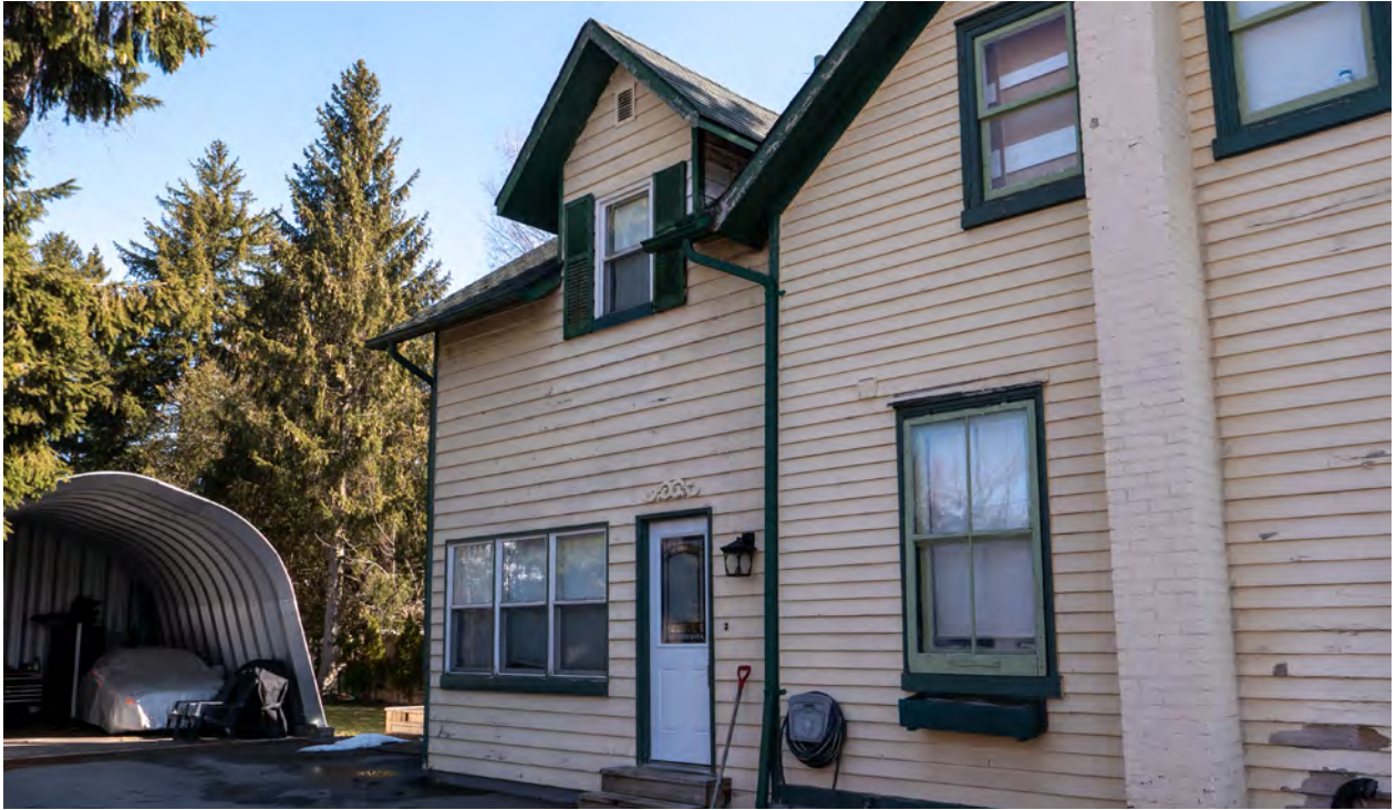
Figure 10: The north extension left of the main south portion. The gable dormer with shuttered window and wide three window opening at grade are both out of character with the Classic Ontario building type (CBCollective 2023).