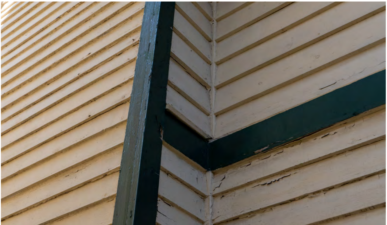
Figure 17: Photograph showing the main south portion (left), next to the historic ground floor section of the north extension (bottom right) and north extension addition (top right). The bottom right siding matches that of the main south portion (CBCollective 2023).