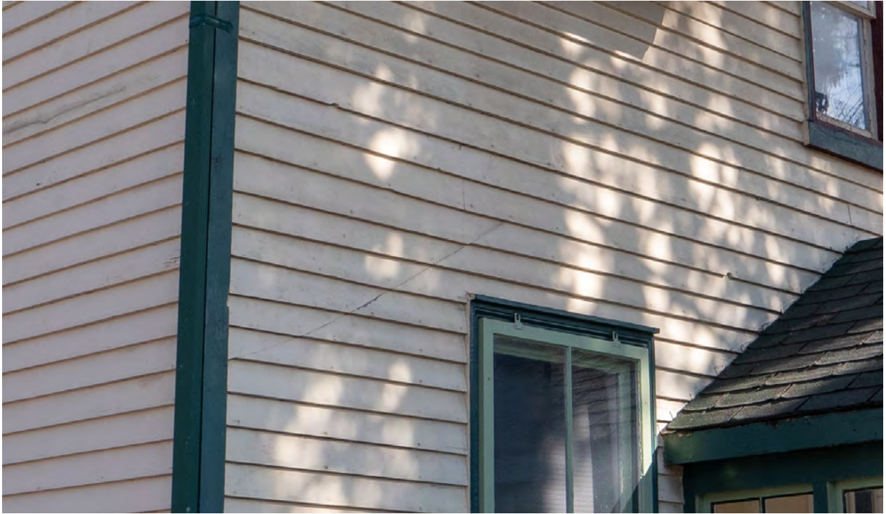
Figure 8: Detail showing scarring from historic bellcast porch roof on historic siding (CBCollective 2023).