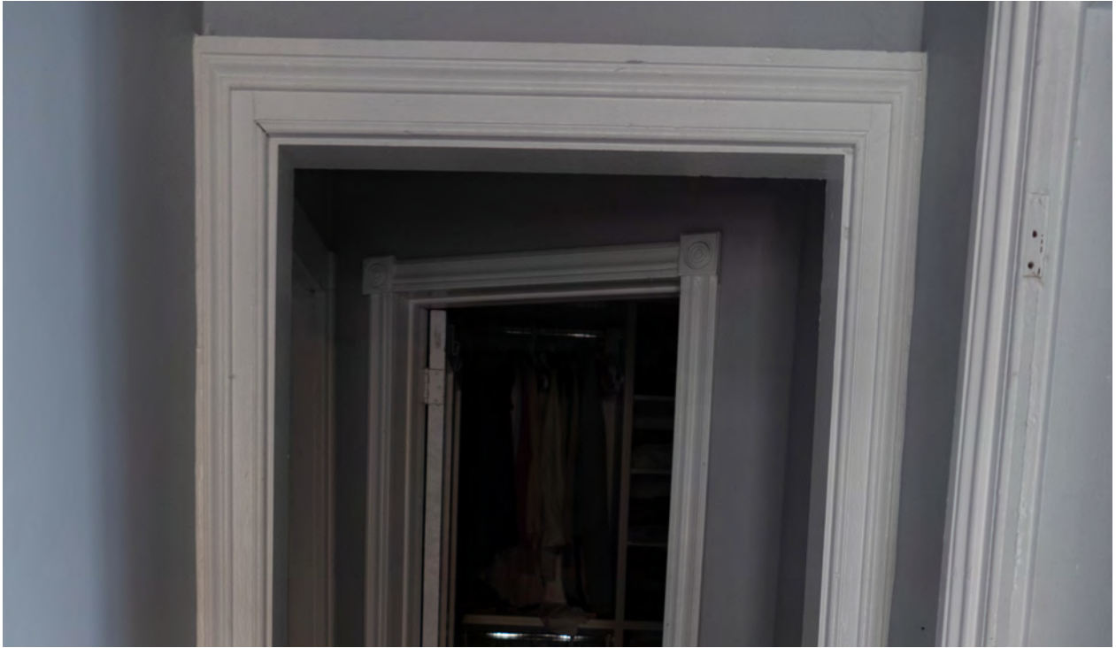
Figure 14: Second floor corridor doorways show historic door casings in the foreground, with later styles visible in the background (CBCollective 2023).