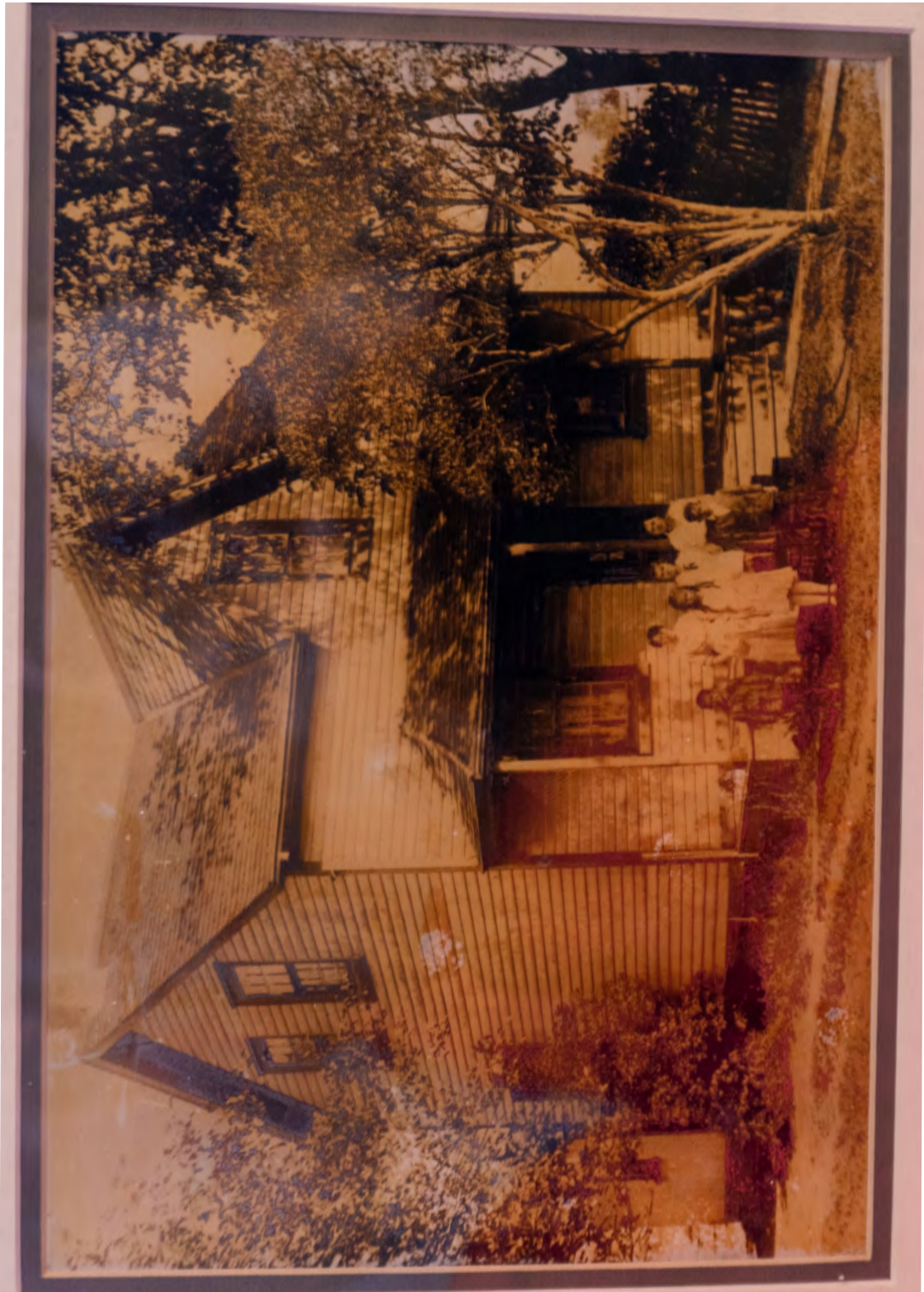
Figure 5: Undated archival photograph looking northeast at 103 Richmond Street. Note the smaller north extension, original windows, inset chimney and historic porch design (CBCollective 2023).