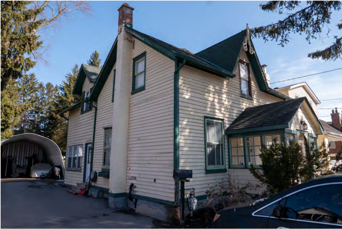
Figure 3: View northeast of the dwelling at 103 Richmond Street, with main south portion in front and north extension behind (CBCollective 2023).