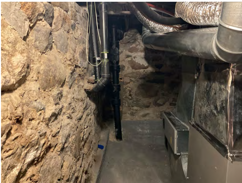
Figure 21: Full Depth Foundation Walls under the main south portion (CBCollective 2023).