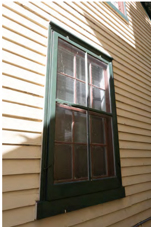
Figure 31: Historic 6-over-6 window on the east elevation of the main south portion at grade (CBCollective 2023).