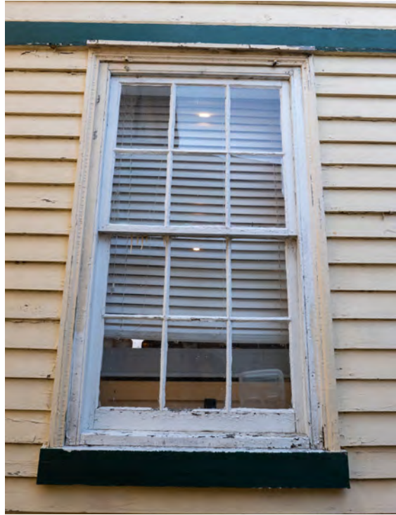
Figure 28: 6-over-6 window with casing on the east elevation of the north extension, showing flat water shedding ledge across the top (CBCollective 2023).