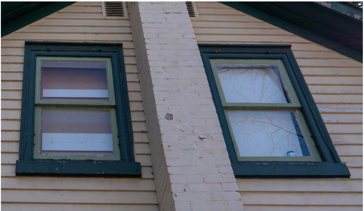
Figure 29: Historic window architraves on the west elevation, showing drip ledges (CBCollective 2023).