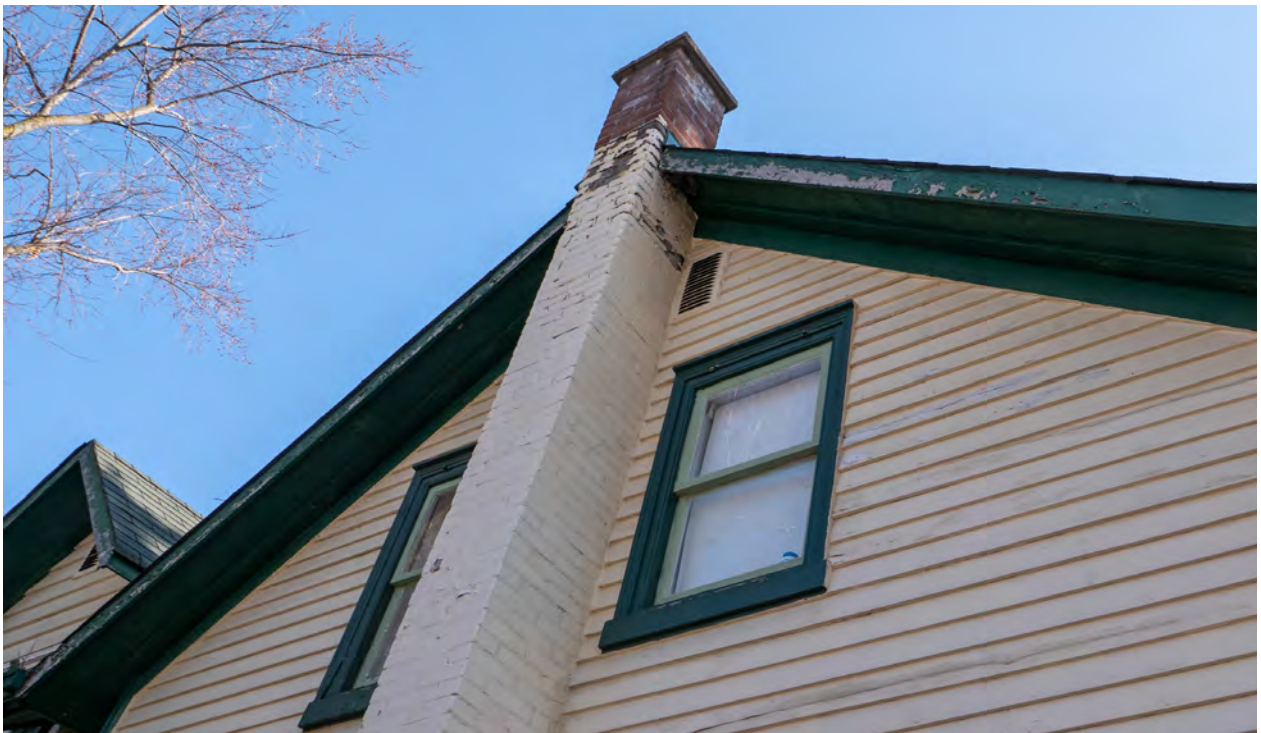
Figure 9: View of the present chimney on the west elevation. The chimney is located over the historic siding (CBCollective 2023).