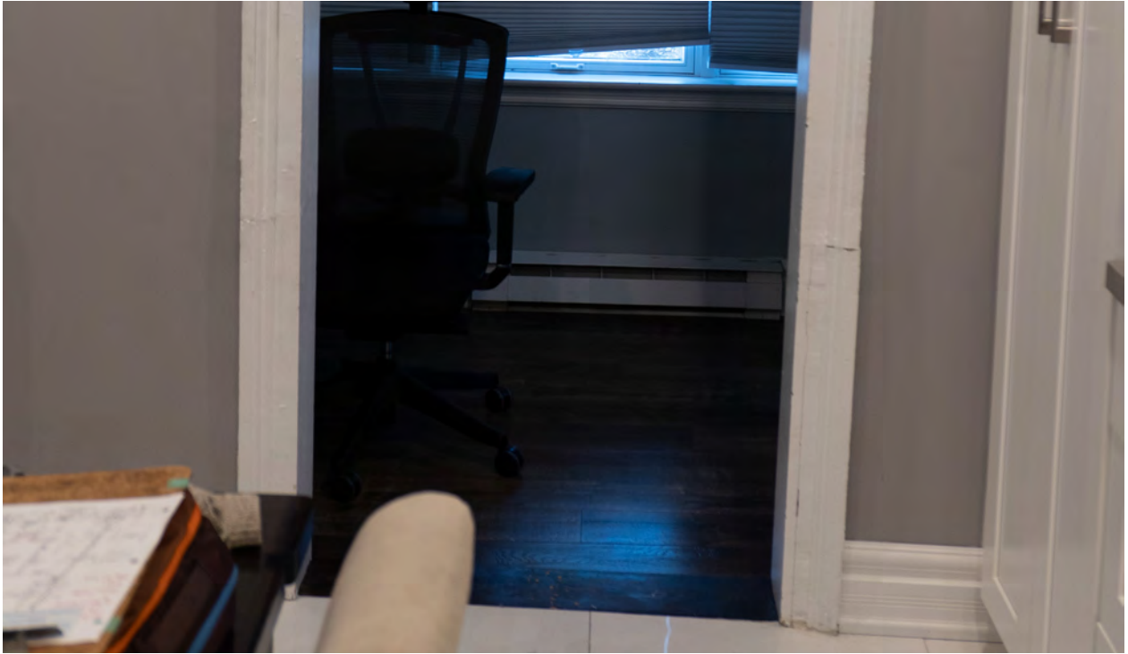
Figure 16: Doorway casings in-line with former side door on west wall of kitchen showing joints, suggesting the opening was originally a window and subsequently expanded to serve as a door (CBCollective 2023).