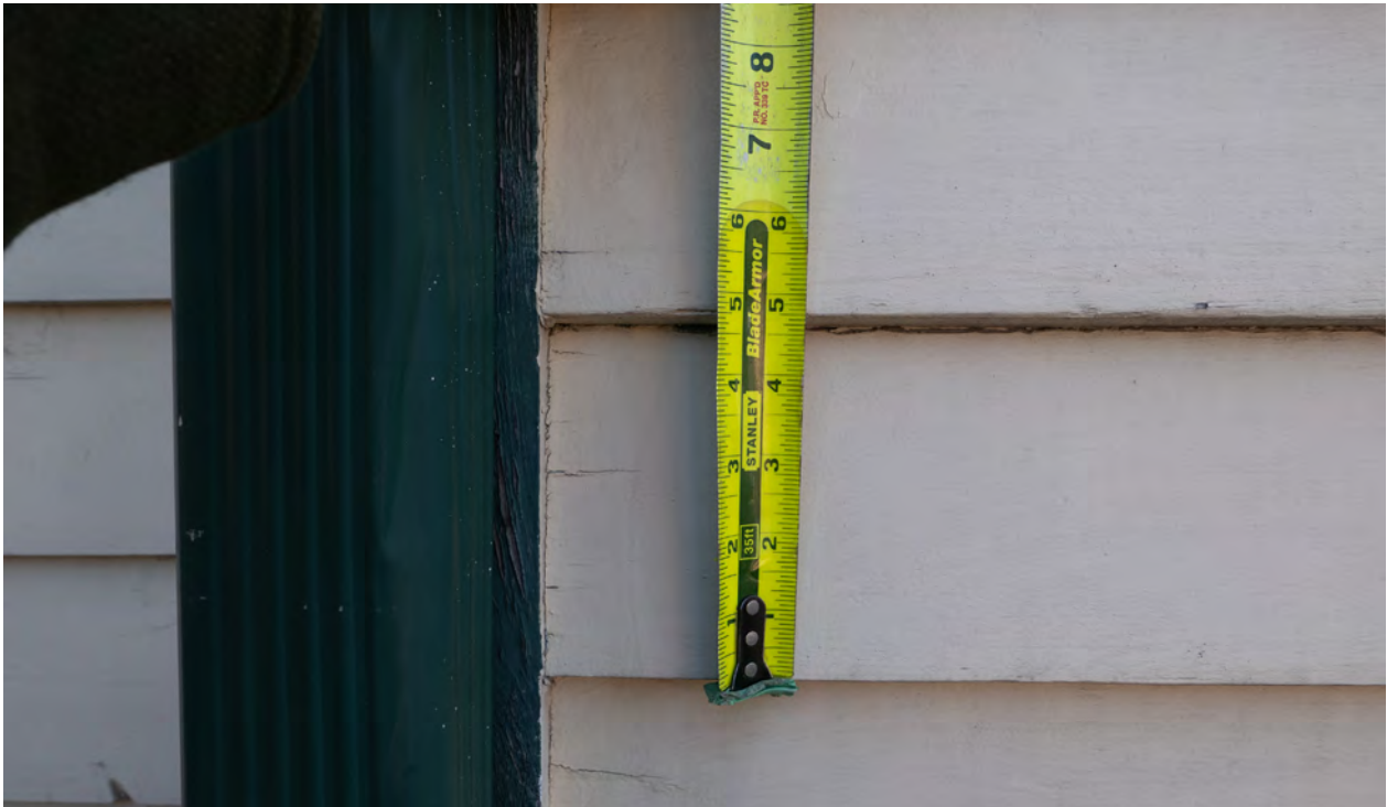
Figure 6: Dimensions of historic siding primarily found on main south portion (CBCollective 2023).