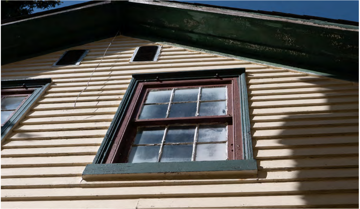
Figure 26: Window architraves shown around an original 6-over-6 window (CBCollective 2023).