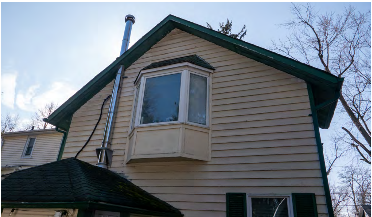
Figure 11: The rear oriel window is out of character with the Classic Ontario building type (CBCollective 2023).