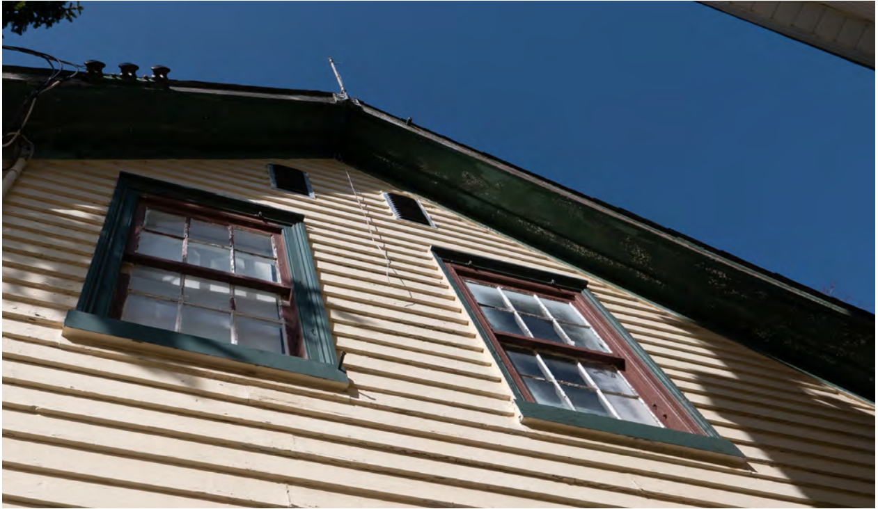
Figure 30: Historic 6-over-6 windows on the east elevation of the main south portion (CBCollective 2023).