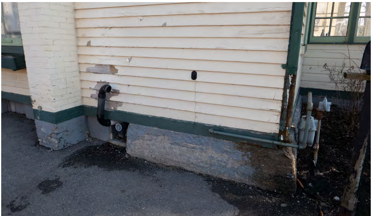
Figure 23: Corner boards on the southwest corner of the main south portion, showing pronounced damaged at unsecured downspout (CBCollective 2023).