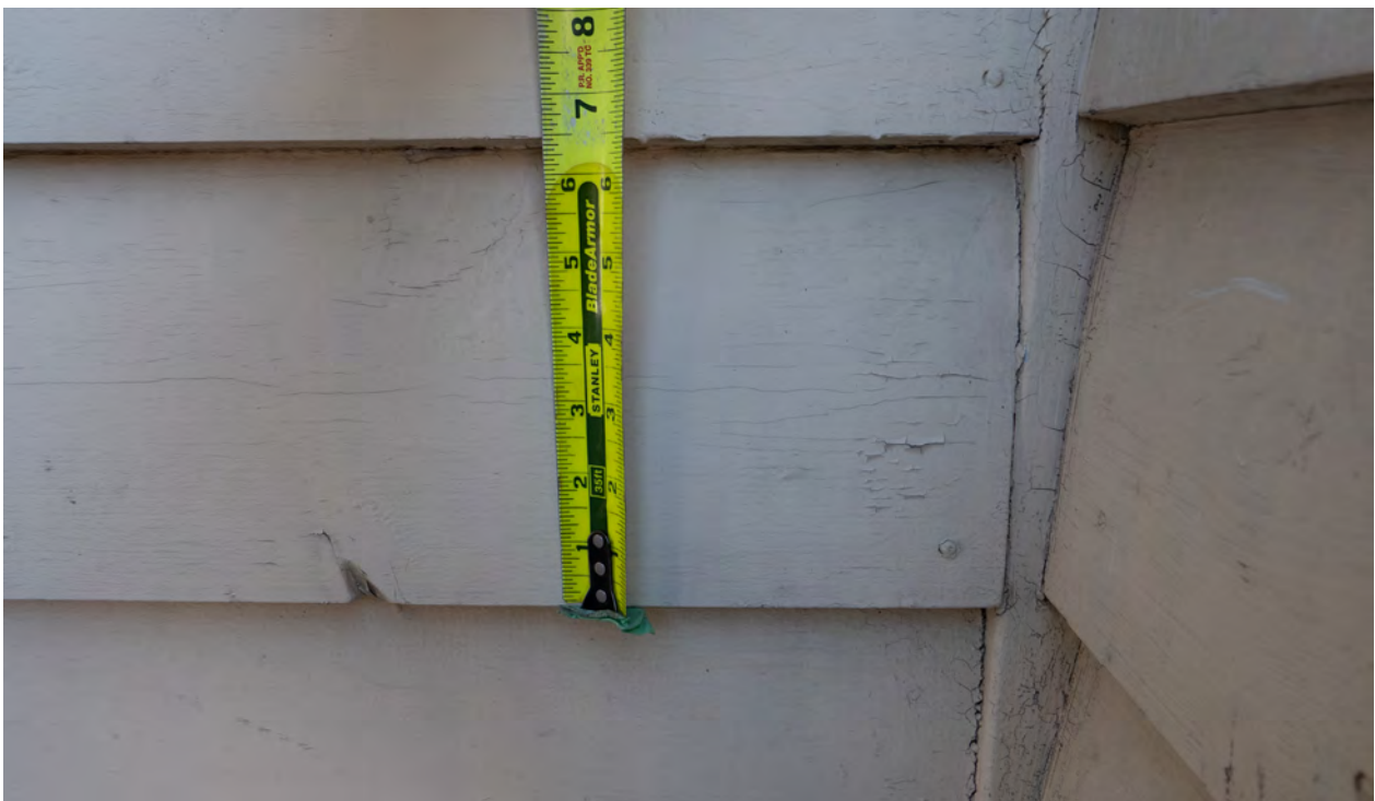
Figure 7: Dimensions of siding attributed to additions, entirely found on the north extension (CBCollective 2023).