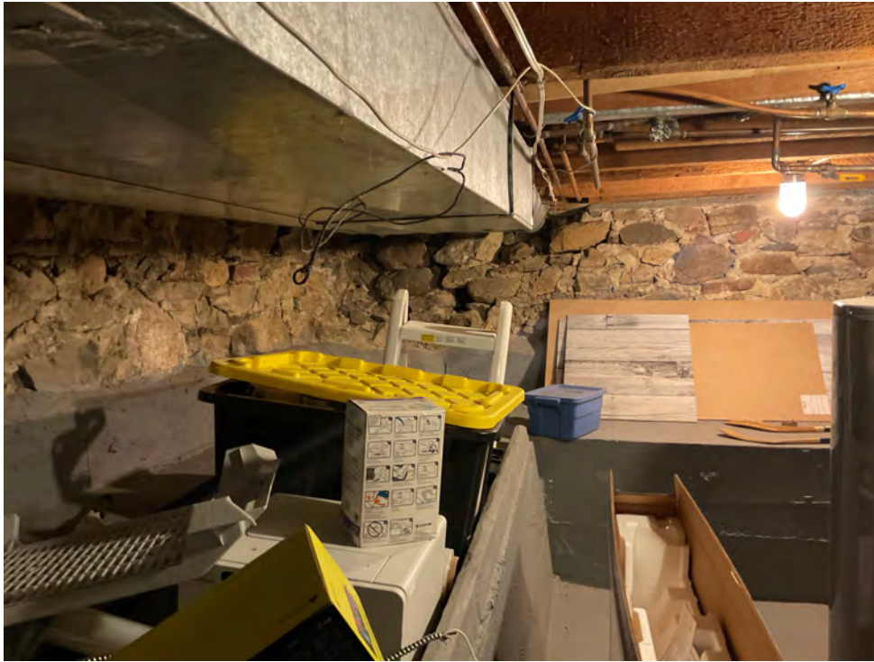
Figure 20: Partial depth foundation walls and subsequent underpinning beneath the north extension (CBCollective 2023).