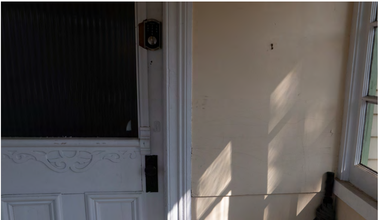
Figure 27: Front door casings display the same moulding profiles as historic windows (CBCollective 2023).