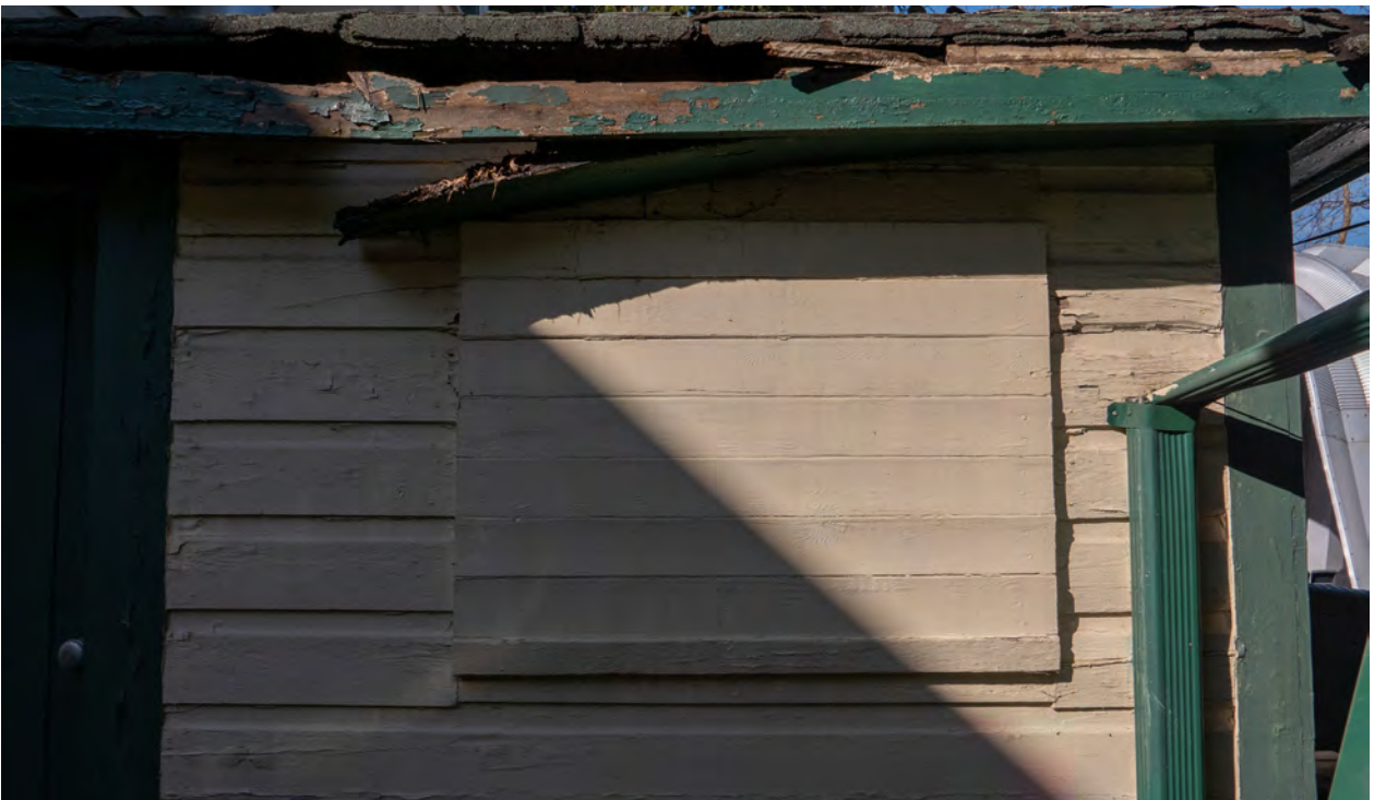
Figure 19: East side of the one-storey vestibule, showing covered openings and damaged fascia.