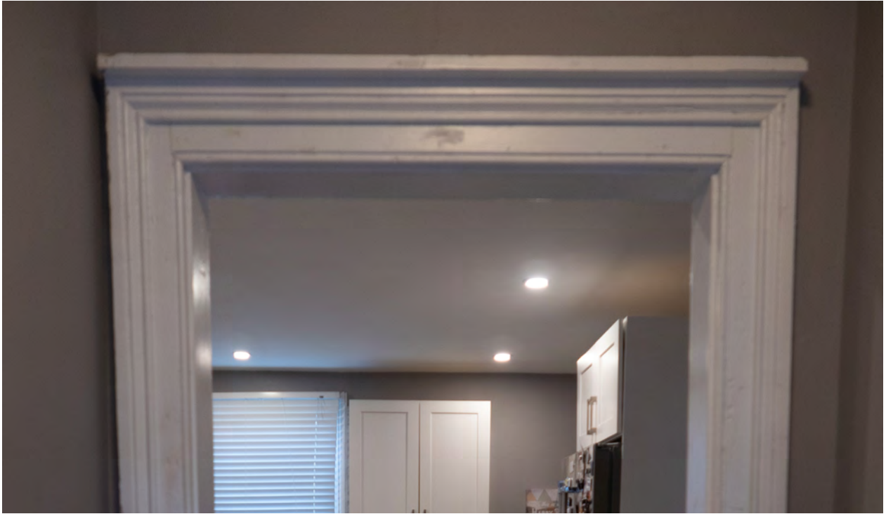
Figure 12: Door casings in the side vestibule contain a drip ledge along the top, consistent with other historic exterior architraves. The opening is likely the historic rear door (CBCollective 2023).