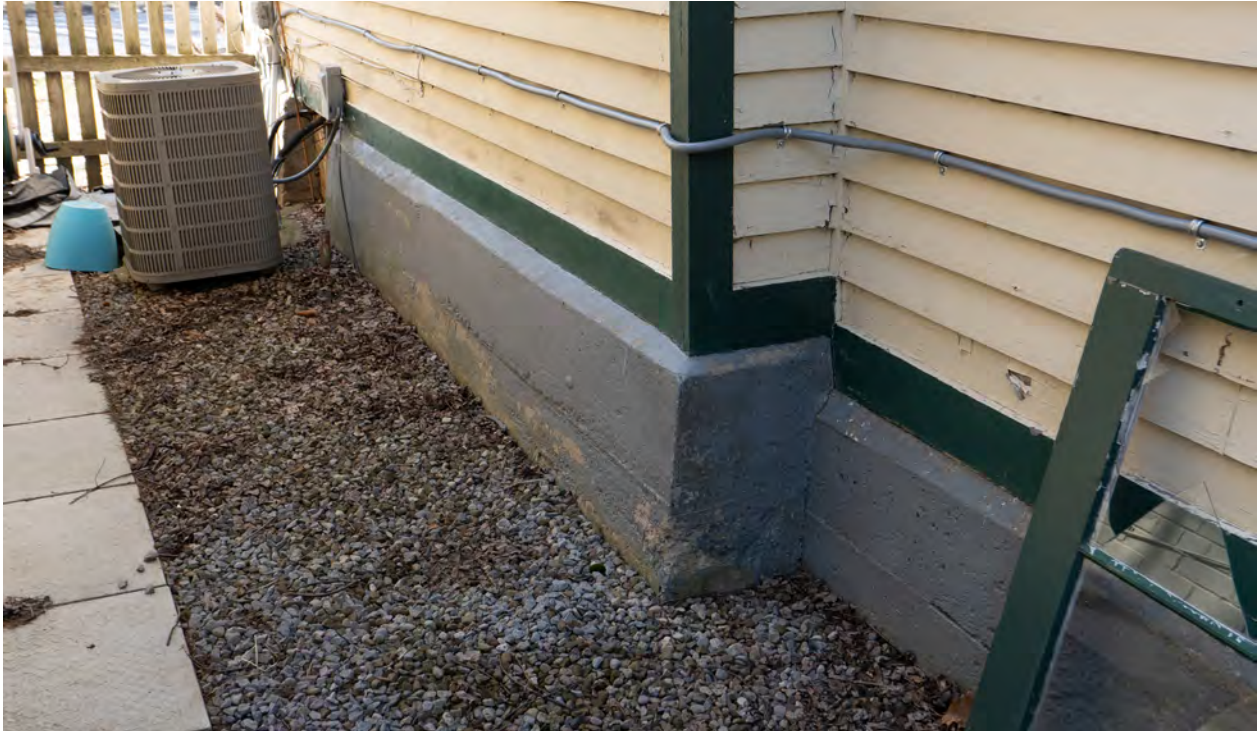
Figure 24: Water table boards running along the east elevation from main south portion (left) to north extension (right) (CBCollective 2023).