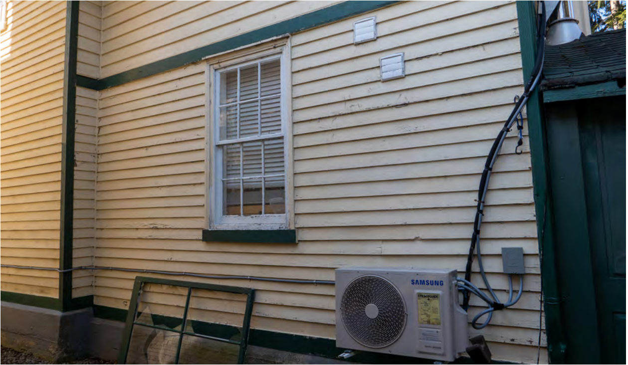
Figure 18: The historic ground floor portion of the north extension, with wooden elements matching those of the main south portion (CBCollective 2023).