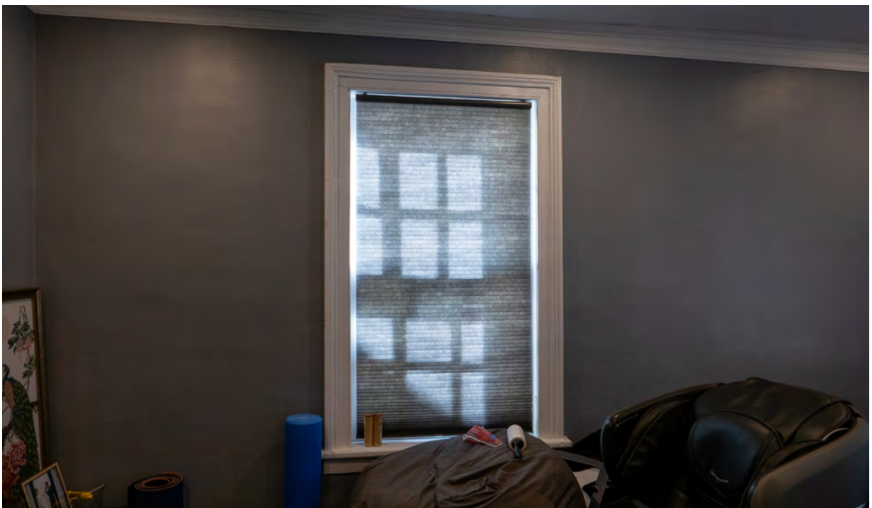
Figure 13: East ground floor window on the main south portion shows architrave profiles and construction methods consistent with other historic openings (CBCollective 2023).