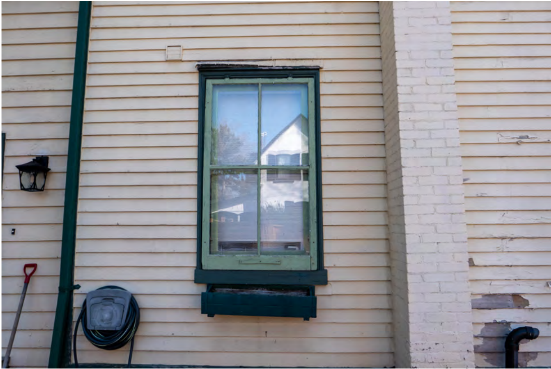
Figure 22: text ( cap ).