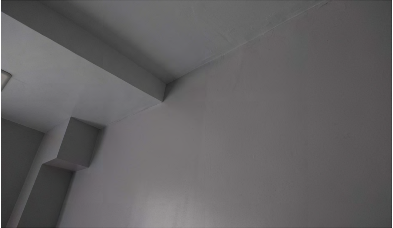
Figure 32: No stenciling was observed in the northwest bathroom of the main south portion, or elsewhere in the house (CBCollective 2023).