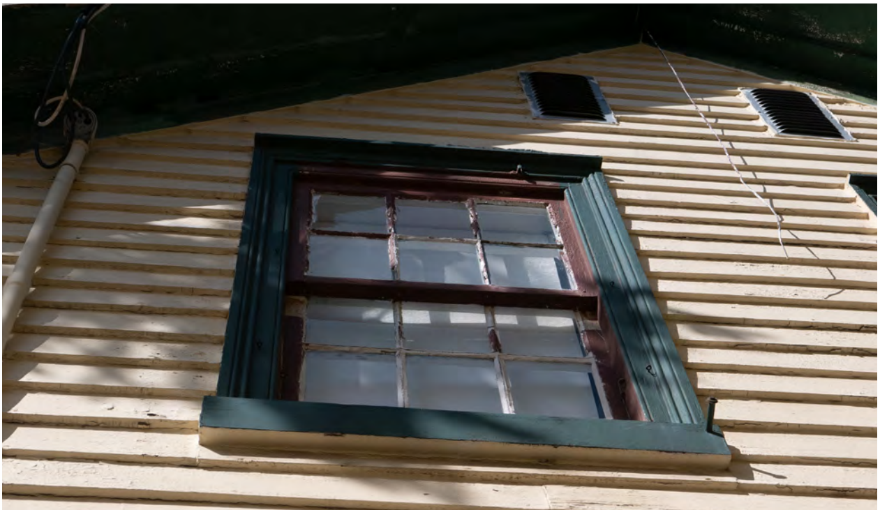
Figure 15: Exterior windows in the west elevation gable show the same moulding profiles and construction, with the addition of a drip ledge above (CBCollective 2023).