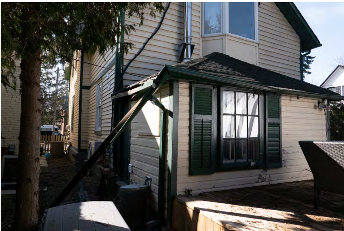
Figure 4: View southwest of the north and east elevations at 103 Richmond Street (CBCollective 2023).