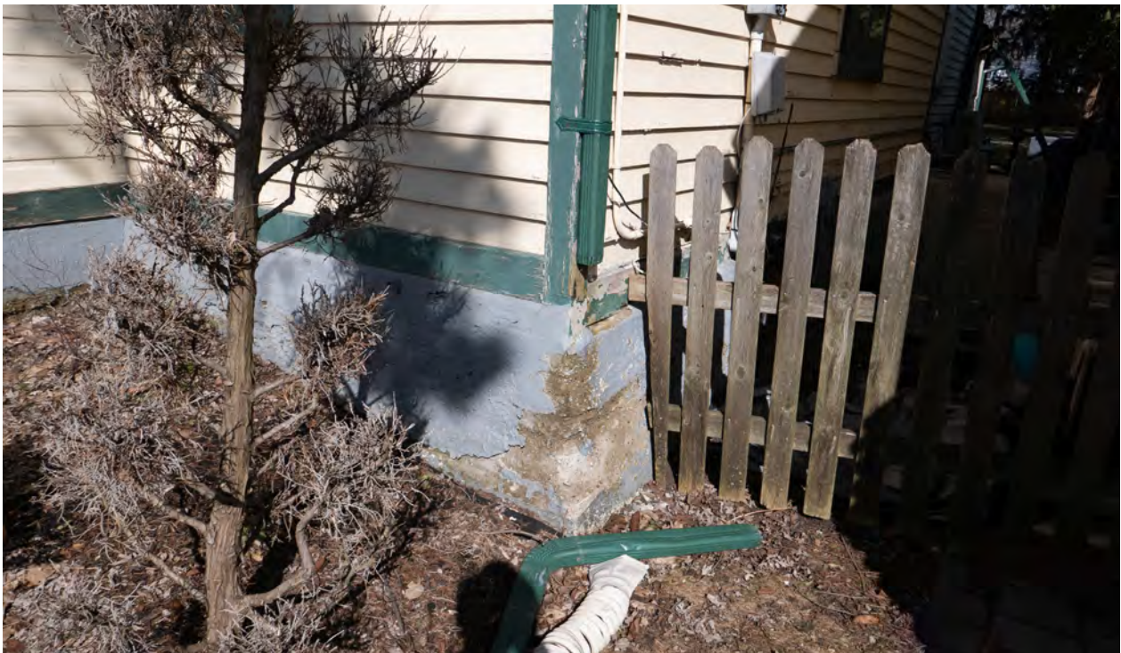
Figure 25: Water table and corner boards at the southeast corner of the main south portion, showing damage from unsecured downspout (CBCollective 2023).