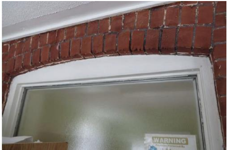
Figure 2 View of 9893 Leslie Street's original red brick cladding, visible from the interior of the enclosed front porch; note that this brick is now completely obscured by the irreversible application of a cementitious coating on the exterior of the building