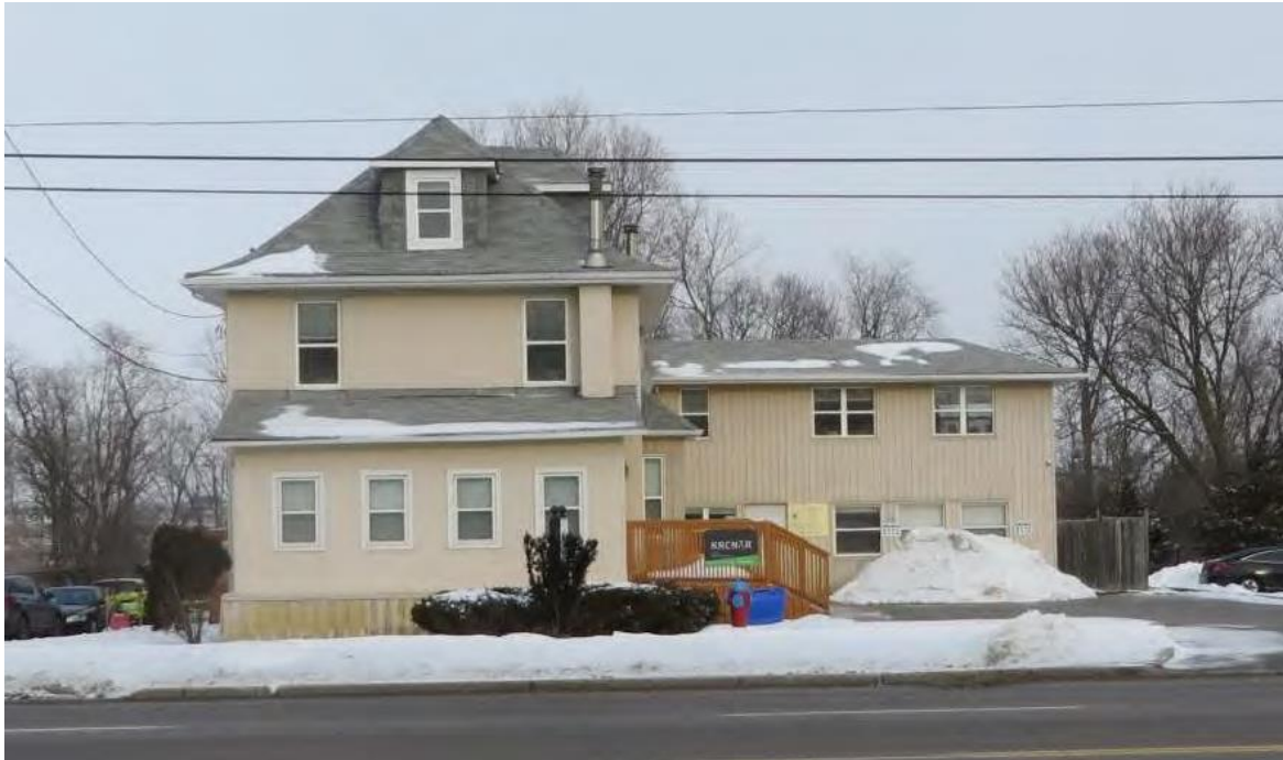
Figure 1 View of the 9893 Leslie Street's west (front) elevation with enclosed front porch, and c. 1960s side/rear addition visible on the right