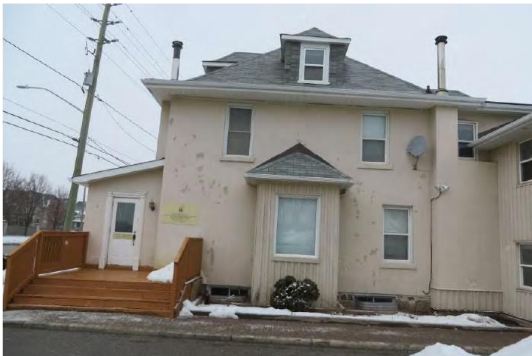
Figure 2 View of the 9893 Leslie Street's south (side) elevation with enclosed front porch on the left, and c. 1960s side/rear addition partially visible on the right