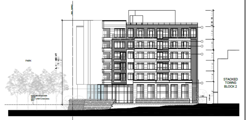
1 NORTH ELEVATION Scale: 1:200

0, 47 and 59 Brookside Road, 12 and 24 Naughton Drive, 0, 11014, 11034, 11044 and 11076 Yonge Street JH/VC SRPBS.23.015