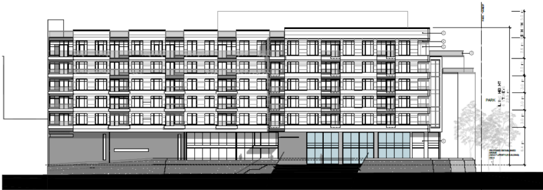
2 EAST ELEVATION Scale: 1:200