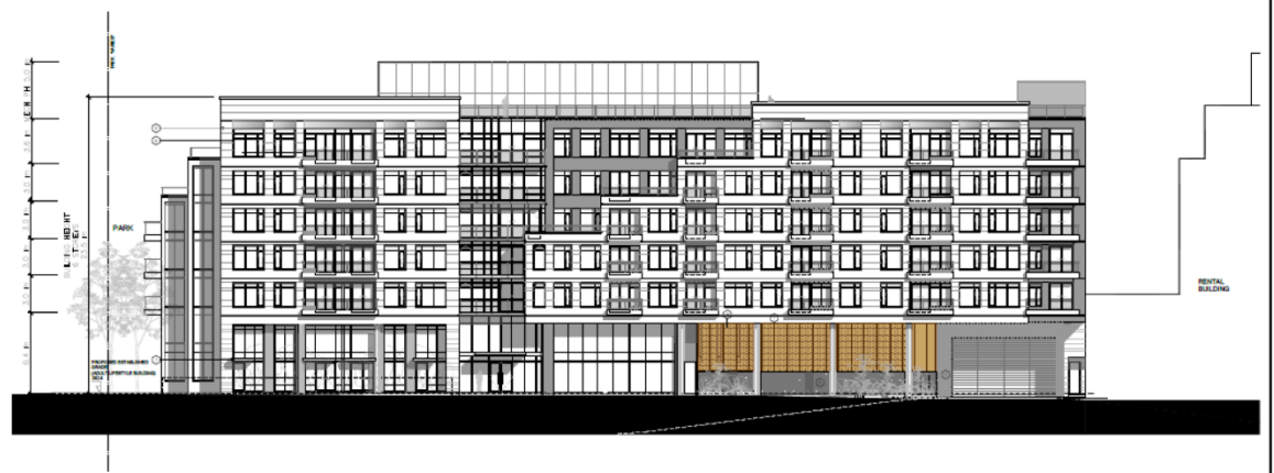
3 WEST ELEVATION Scale: 1:200