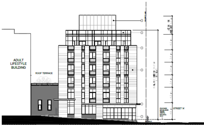
2 WEST ELEVATION - PRIVATE STREET Scale: 1:200