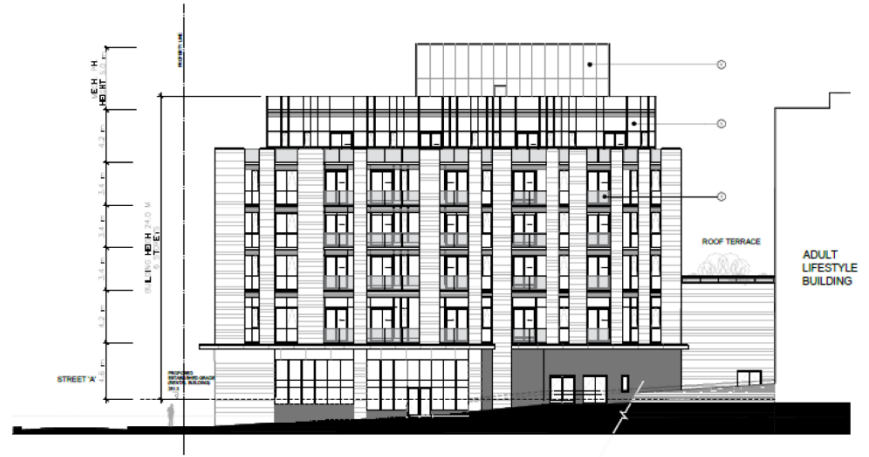
3 EAST ELEVATION - PARK SIDE Scale: 1:200