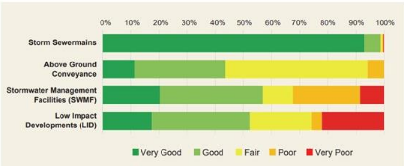
Fig. 4 Condition Profile for SWM

Fiscally sustainable asset management over the long-term is imperative considering the sizeable valuation of the City’s SWM infrastructure and the multiple decades over which the lifecycle of these assets will span.