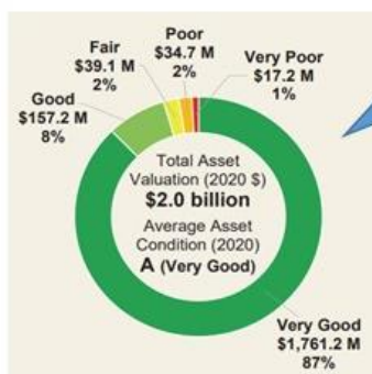
Fig. 2 Asset Condition Distribution and Valuation