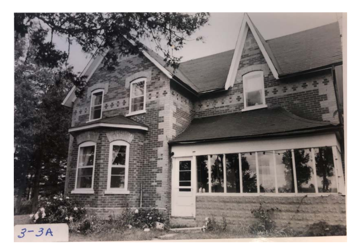
Figure 4 1985 photograph of the William Munro House, before it was relocated to 9835 Leslie Street. Note that the bellcast-roofed front verandah was enclosed at this point, and later restored to an open verandah when the property was relocated in 2006.