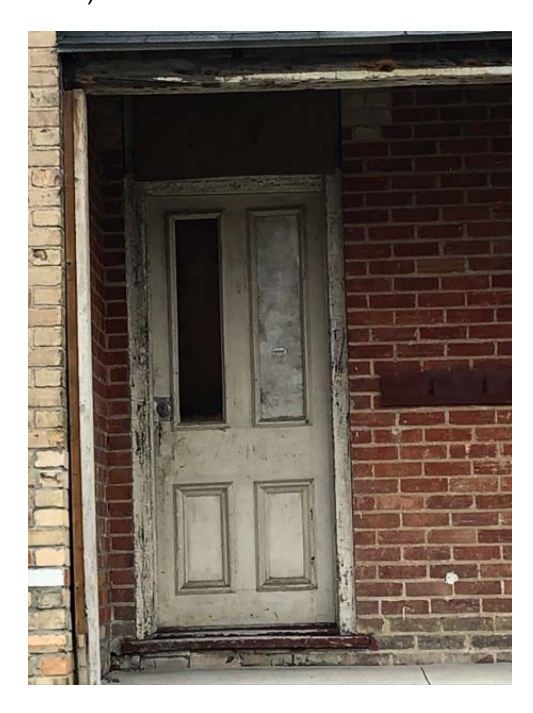
Figure 8 Detailed photograph of the William Munro House's main (west) entryway, featuring a wooden paneled door topped by a transom (currently covered with plywood as a protective measure). (Source: HUD, 2024).