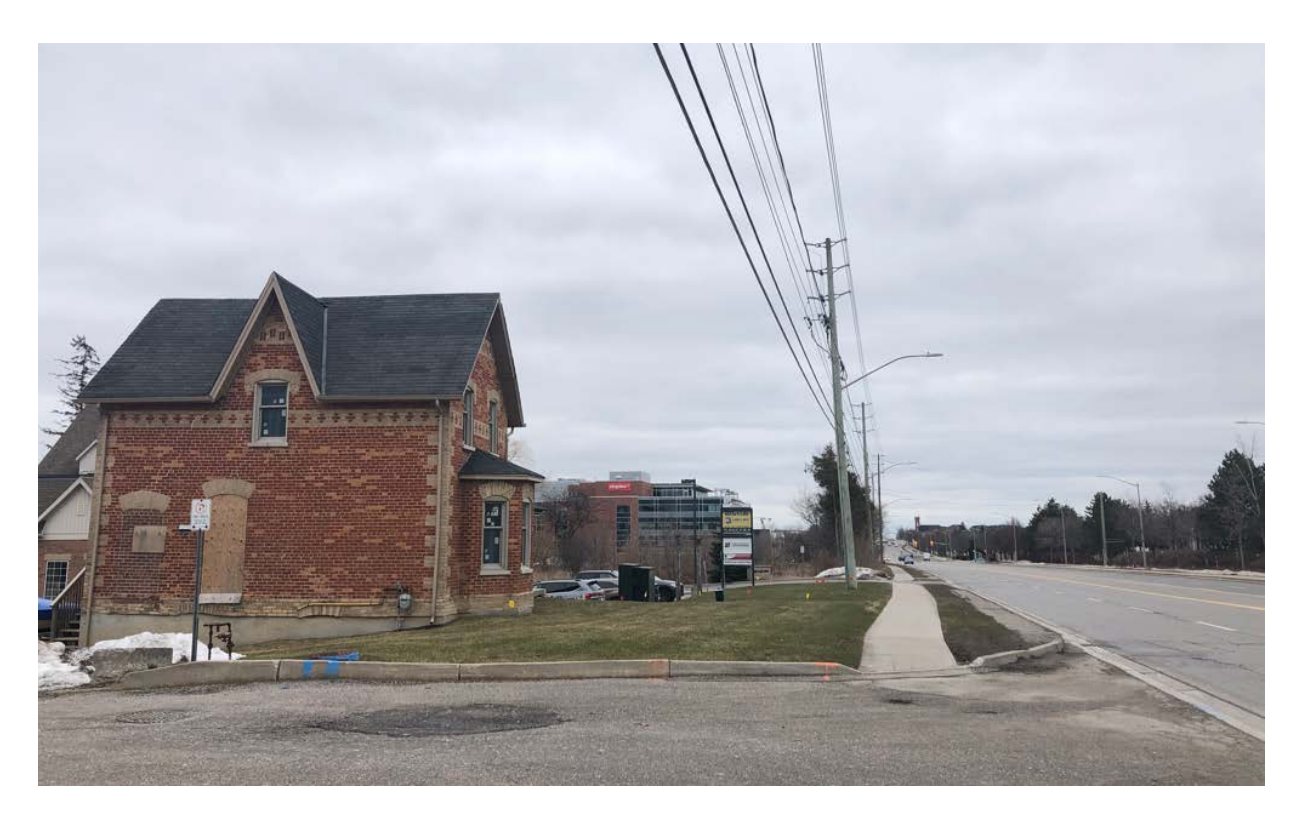
Figure 7 Photograph of the William Munro House's north (side) and partial front (west) elevations, looking south from Leslie Street. Note the building's 1 ½-storey massing, medium-pitched cross-gabled roof with steep central gable on the building's north elevation, playful dichromatic brickwork, segmental arched windows and doors, and projecting bay window with hipped roof on the west elevation. Also note the original segmental arched basement window voussoirs visible on the north elevation (Source: HUD, 2024).