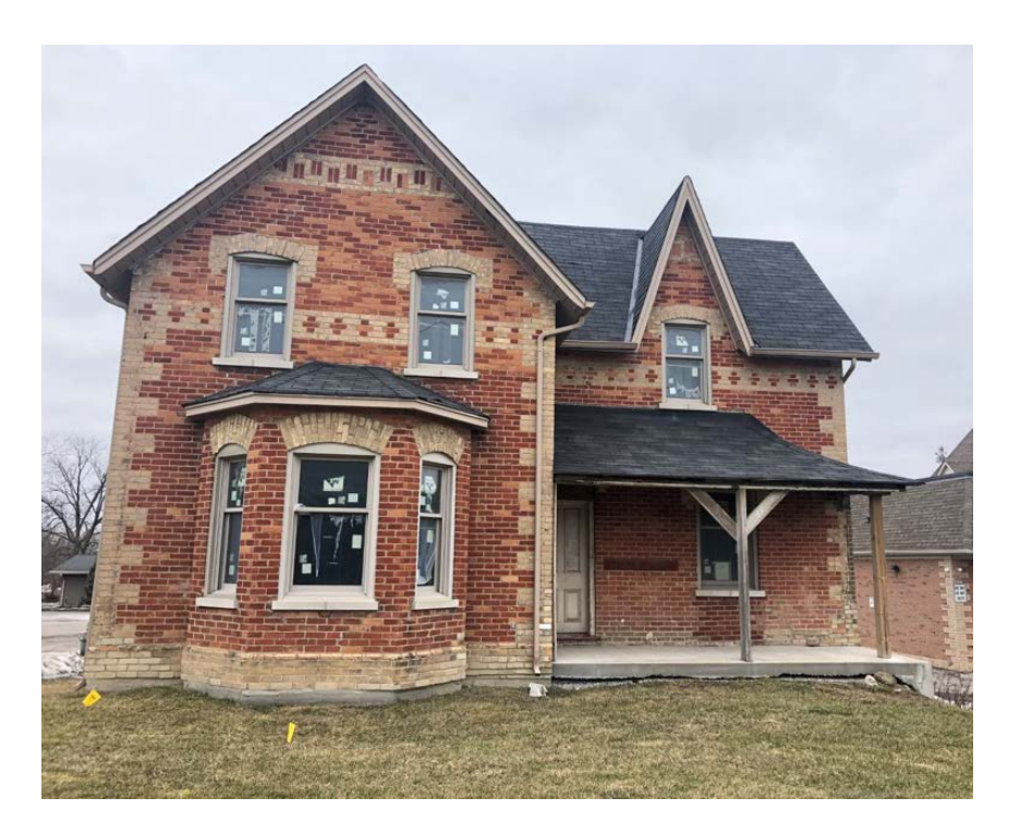
Figure 5 Photograph of the William Munro House's front (west) elevation, looking east from Leslie Street. Note the building's 1 ½-storey massing, medium-pitched cross-gabled roof with steep central gable on the building's ell, playful dichromatic brickwork, segmental arched windows, projecting bay window with hipped roof, and main entrance with a paneled wooden door and bellcast-roofed verandah (Source: HUD, 2024).