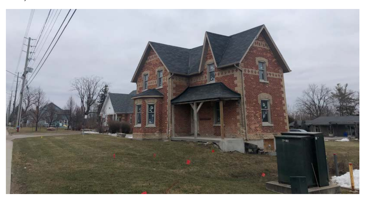
Figure 6 Photograph of the William Munro House's front (west) and south (side) elevations, looking northeast from Leslie Street. Note the building's 1 ½-storey massing, T-shaped plan, medium-pitched cross-gabled roof with steep central gable on the building's ell, playful dichromatic brickwork, segmental arched windows, projecting bay window with hipped roof, and main entrance with a paneled wooden door and bellcast-roofed verandah (Source: HUD, 2024).