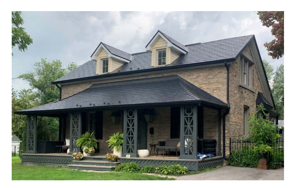
Figure 2 View of the James Freek House's front (south) and partial east (side) elevation, looking northwest. Note the building's saltbox roof with gabled dormers, buff brick cladding, segmental-arched windows with brick voussoirs and stone sills, and bellcast-roofed verandah with treillage.