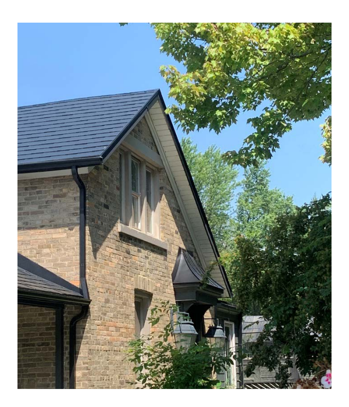
Figure 4 Detailed view of the James Freek House's east (side) elevation, looking northwest. Note the house's saltbox roof at the east gable end.