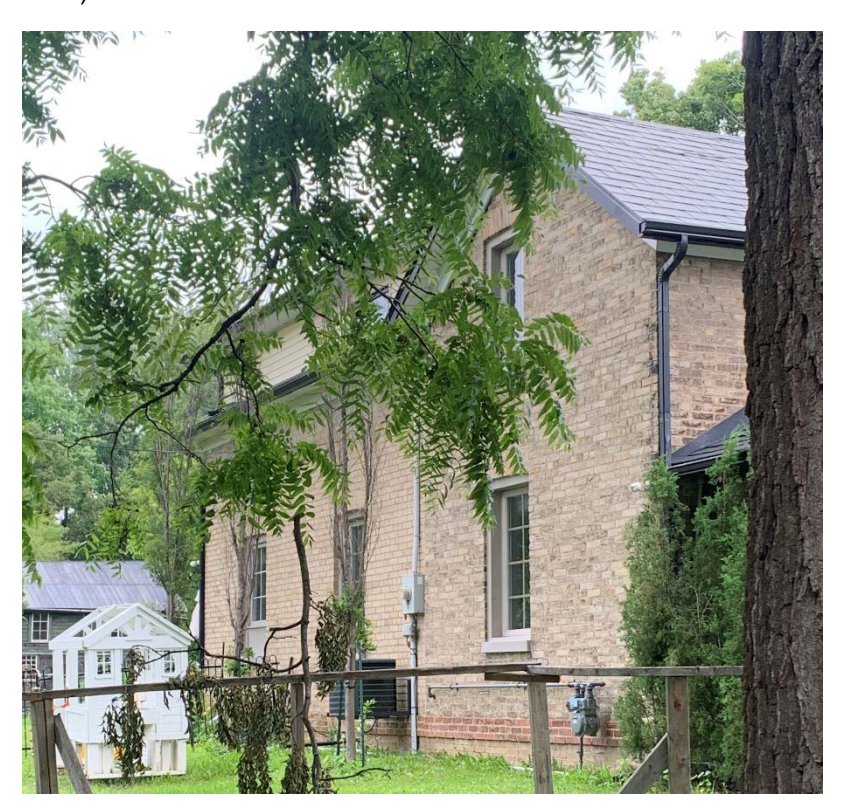
Figure 3 View of the James Freek House's west (side) elevation, looking northeast. Note the pink-brick water table above the foundation, segmental-arched window openings with brick voussoirs and stone sills, and the later buff-brick rear addition.