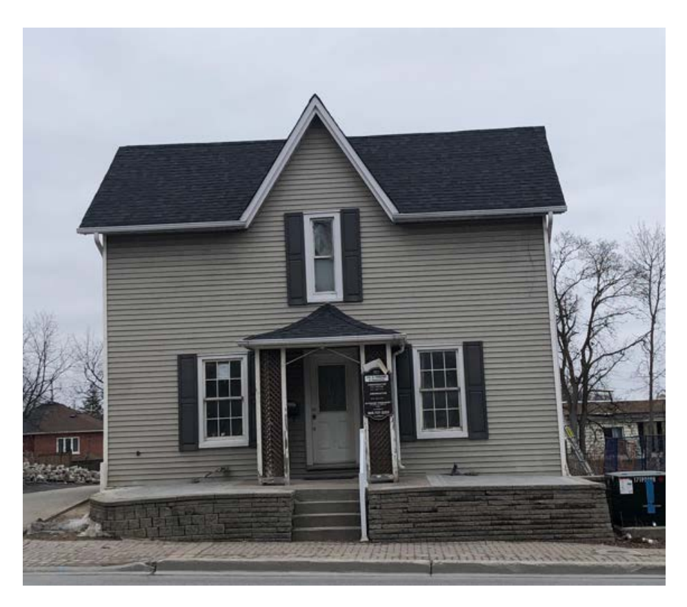
Figure 6 Photograph of 10039 Yonge Street's front (west) elevation, looking east from Yonge Street. Note the building's 1 ½-storey massing, simple, rectangular plan, medium-pitched side-gabled roof, central dormer inset with a narrow second-storey window, the balanced composition of its front (west) façade, flat-headed window and door openings, and central portico entry.