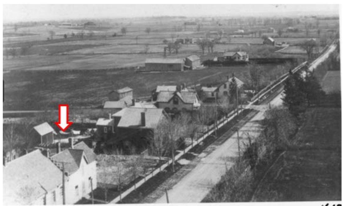
Figure 2 Circa 1900 photograph of Yonge Street, looking southeast from the Presbyterian Church tower, with the subject property at 10039 Yonge Street shown in its present location, on the far left of the image