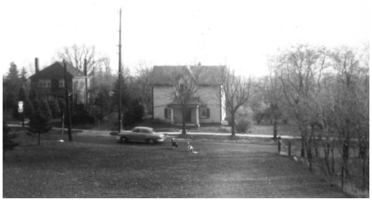
Figure 4 Circa 1940 photograph of the subject property at 10039 Yonge Street, looking east from west of Yonge Street.