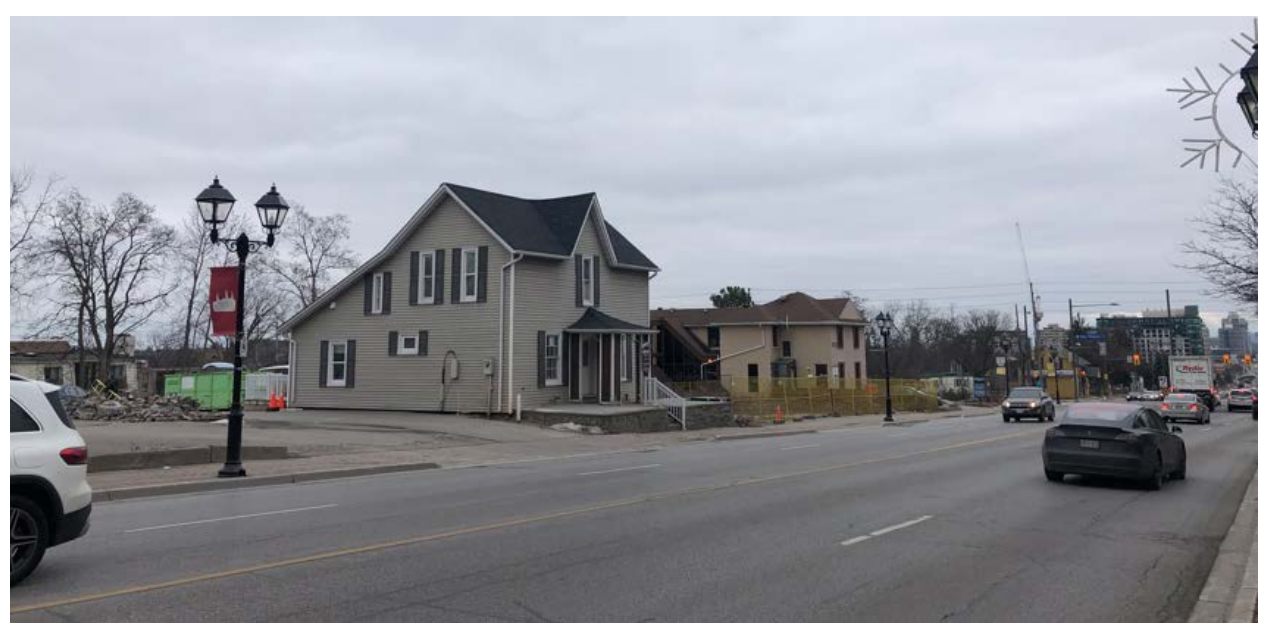
Figure 8 Photograph of 10039 Yonge Street looking southeast from Yonge Street (Source: HUD, 2024).