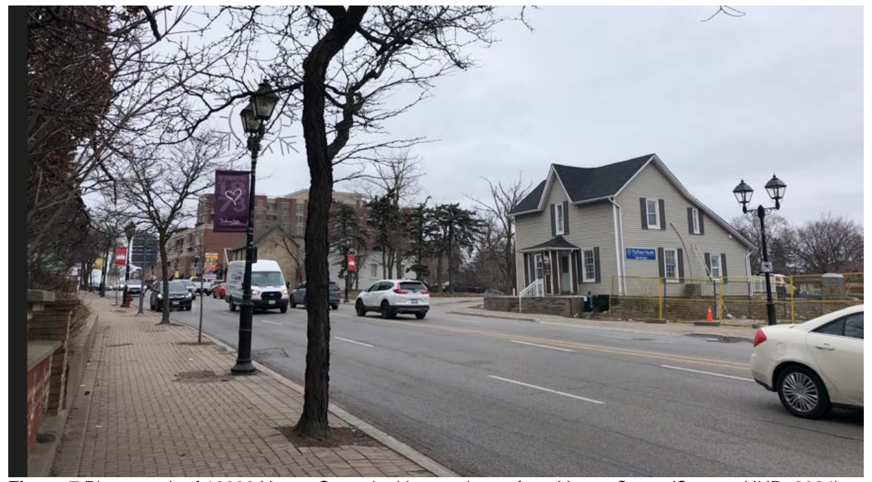
Figure 7 Photograph of 10039 Yonge Street looking northeast from Yonge Street.