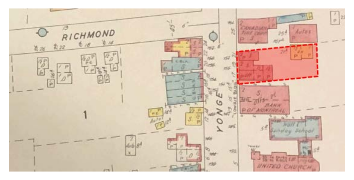
Figure 4 Detail of the 1960 fire insurance plan showing the approximate location of the John Coulter Tailor Shop at 10217 Yonge Street (in red).