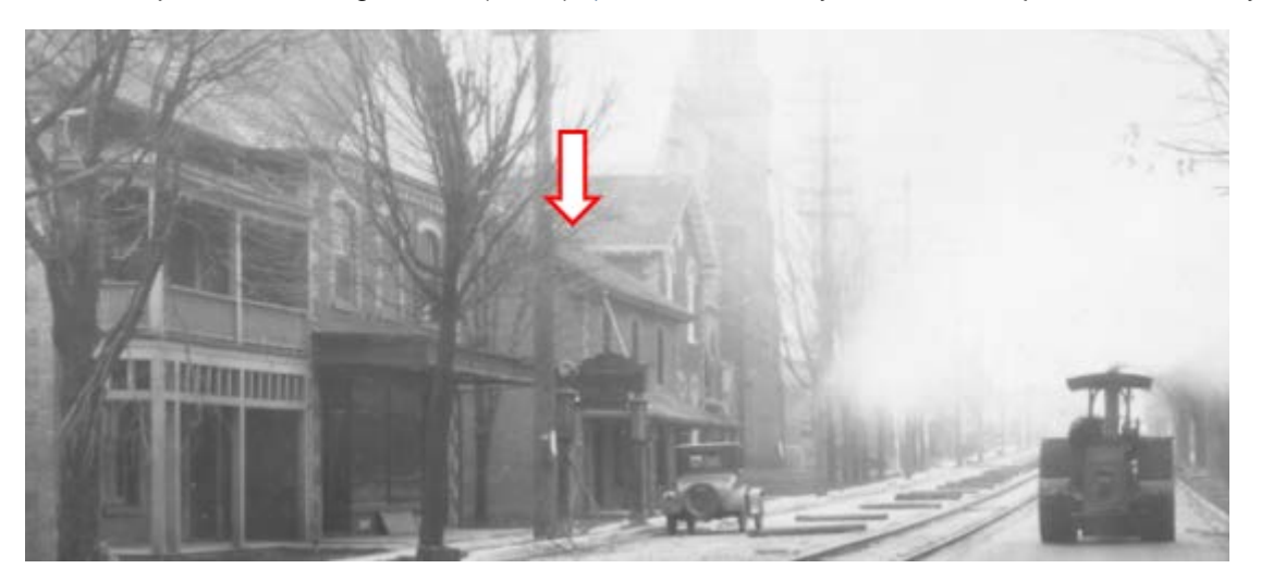
Figure 3 C1927 photograph of the John Coulter Tailor Shop (indicated by the arrow), taken from Yonge Street looking southeast. Photograph indicates that the building was originally red brick with buff brick quoins on the front (west) façade.