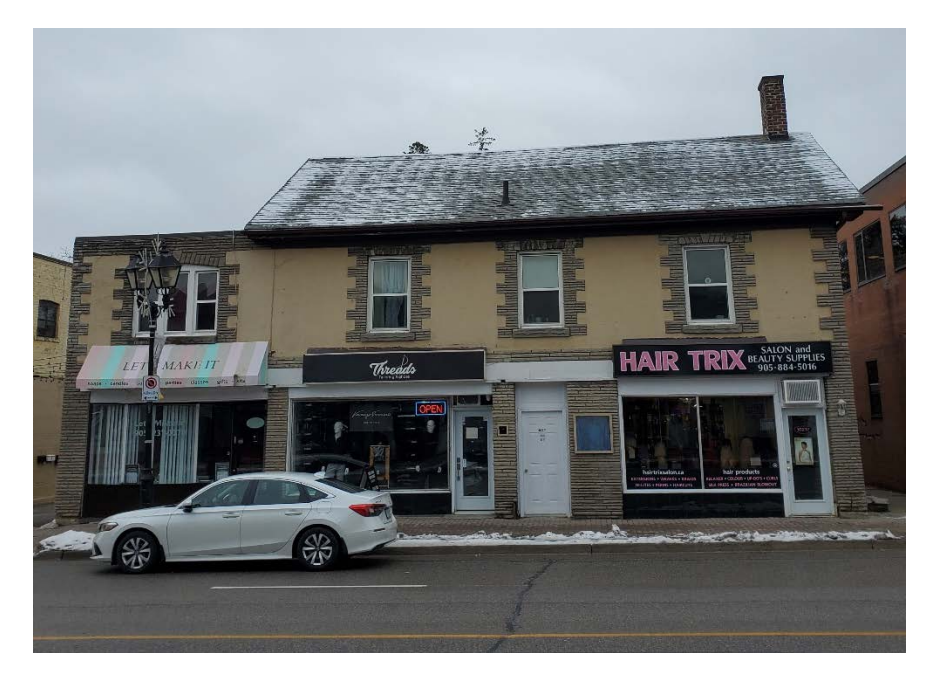
Figure 5 Current photograph looking east, showing the principal (west) elevation of 10217 Yonge Street. Note the building's two-storey massing, side gable roof, and symmetrical three-bay front (west) façade on the main portion of the building.

Figure 4 Detail of the 1960 fire insurance plan showing the approximate location of the John Coulter Tailor Shop at 10217 Yonge Street (in red).