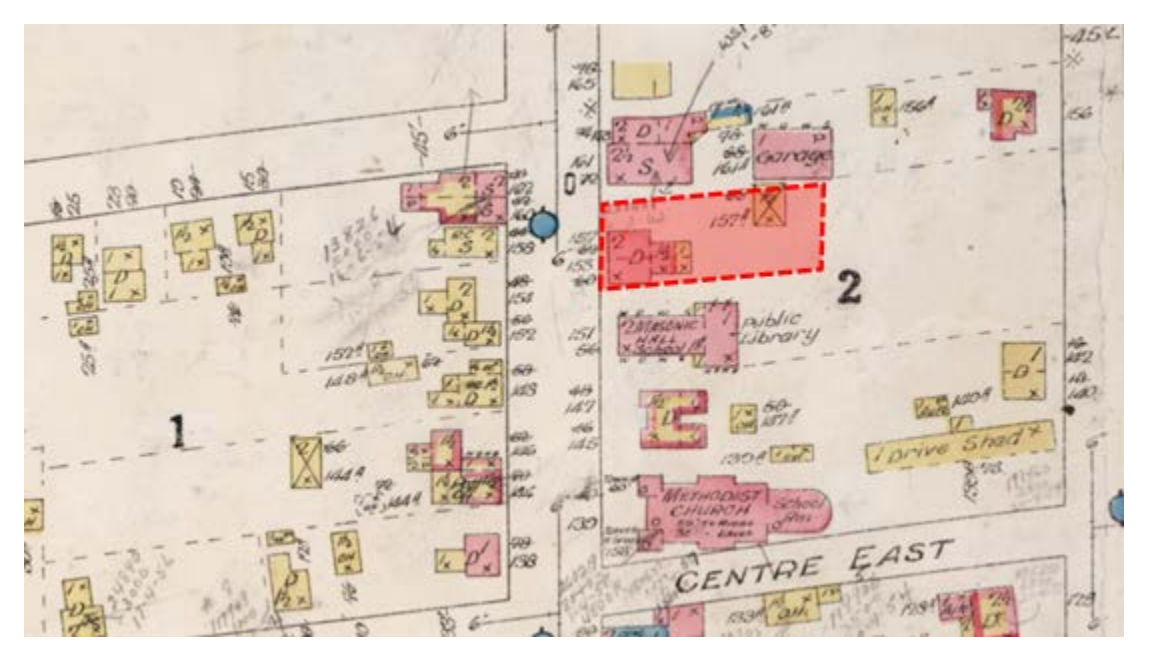
Figure 2 Detail of the 1923 fire insurance plan showing the approximate location of the John Coulter Tailor Shop at 10217 Yonge Street (in red).