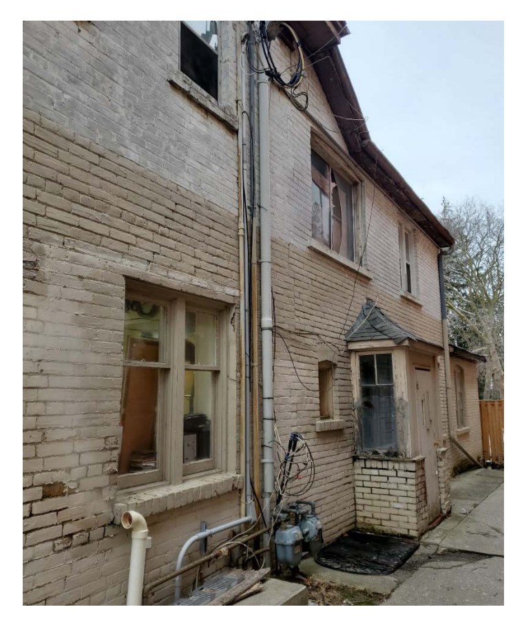
Figure 6 Current photograph looking northeast, showing the south elevation of 10217 Yonge Street. Note the wooden window units and brick lintels and sills.