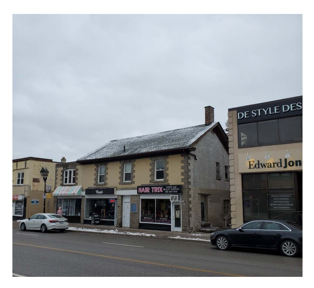
Figure 7 Current photograph of 10217 Yonge Street looking northeast, showing the site's context on Yonge Street. Note the surrounding small-scale commercial structures.