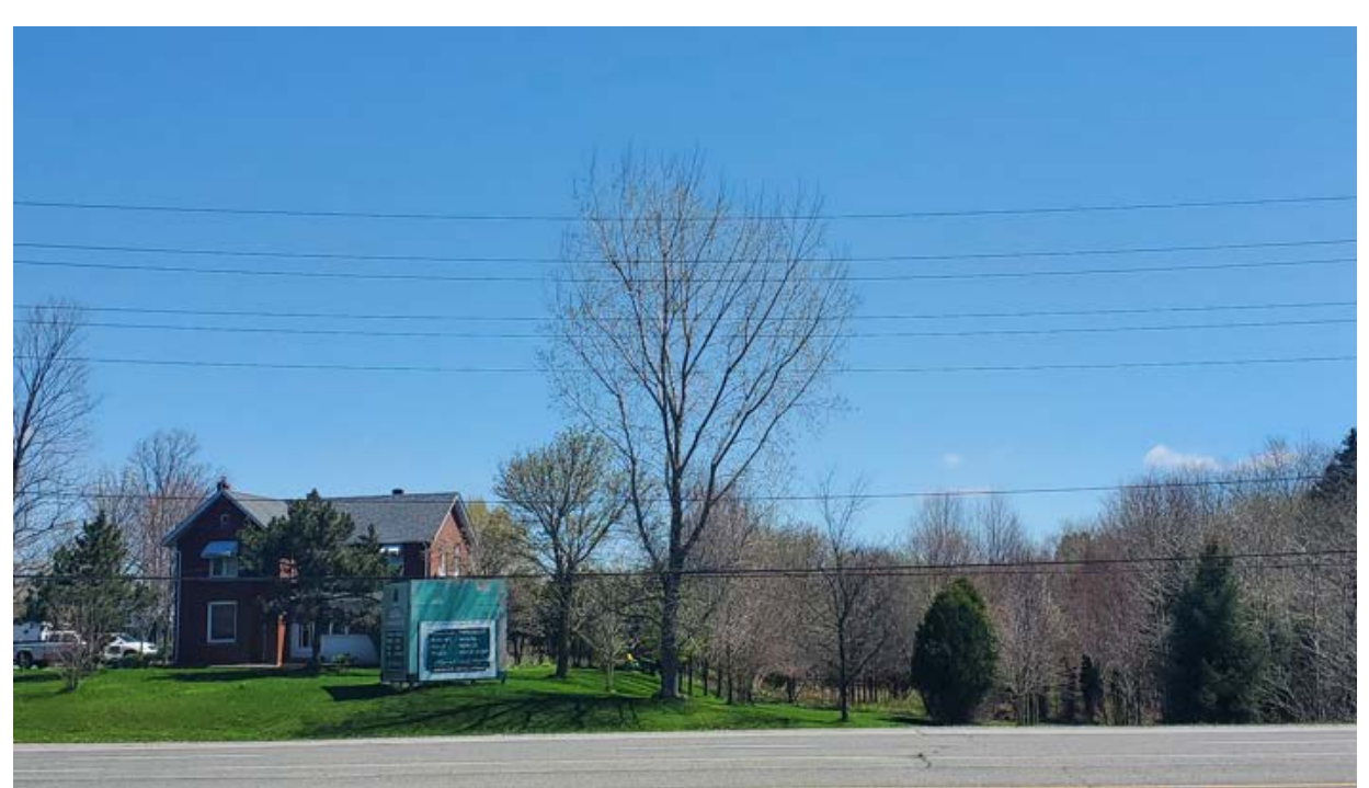
Figure 5 Current photograph of the Ryan-Paxton House at 12345 Yonge Street facing east. Note the surrounding context, including the sparse development and thick vegetation. (Source: HUD, 2024)

Figure 4 Current photograph of the Ryan-Paxton House at 12345 Yonge Street, showing the building's south (side) elevation. Note the building's cross-gabled roof and enclosed hip-roofed side (south) verandah.(Source: HUD, 2024)