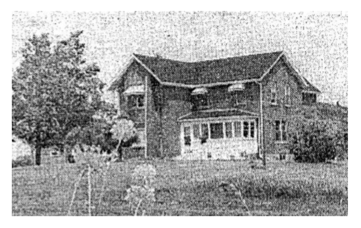
Figure 2 Circa 1984 photograph of the Ryan-Paxton House at 12345 Yonge Street, showing the building's principal (west) elevation. Note the building's 2-storey massing, red brick veneer, complex cross-gabled roof, projecting bay, hipped-roof verandah, and roundel attic window.