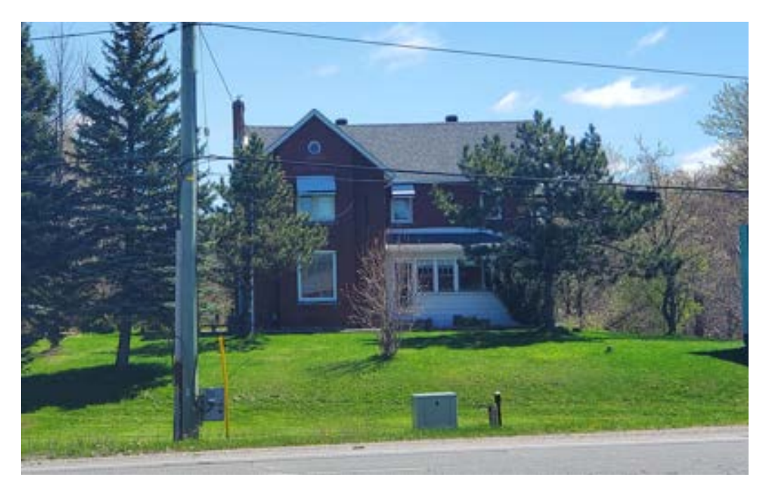
Figure 3 Current photograph of the Ryan-Paxton House at 12345 Yonge Street, showing the building's principal (west) elevation. Note the building's 2-storey massing, red brick veneer, complex cross-gabled roof, projecting bay, enclosed hipped-roof front verandah, and roundel attic window.

Figure 2 Circa 1984 photograph of the Ryan-Paxton House at 12345 Yonge Street, showing the building's principal (west) elevation. Note the building's 2-storey massing, red brick veneer, complex cross-gabled roof, projecting bay, hipped-roof verandah, and roundel attic window.