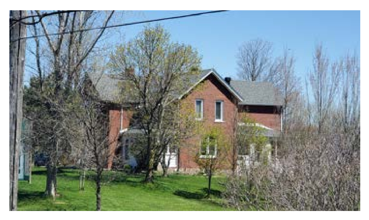
Figure 4 Current photograph of the Ryan-Paxton House at 12345 Yonge Street, showing the building's south (side) elevation. Note the building's cross-gabled roof and enclosed hip-roofed side (south) verandah.