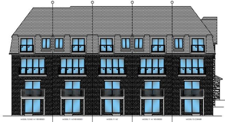
BLOCK A REAR ELEVATION