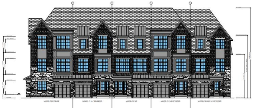
BLOCK A FRONT ELEVATION