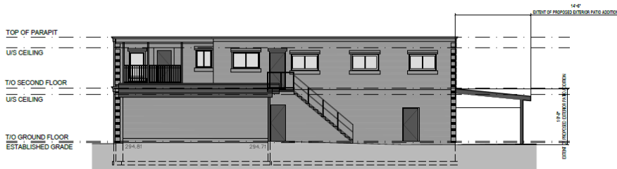
3 SOUTH ELEVATION AT.2 3/32" = 1'-0"