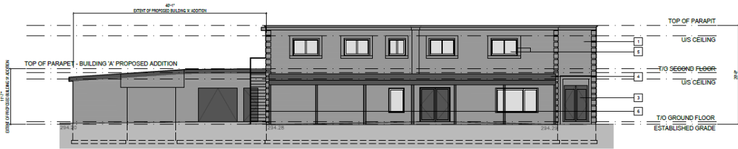
1 WEST ELEVATION AT.2 3/32" = 1'-0"