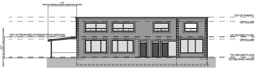
4 NORTH ELEVATION AT.2 3/32" = 1'-0"