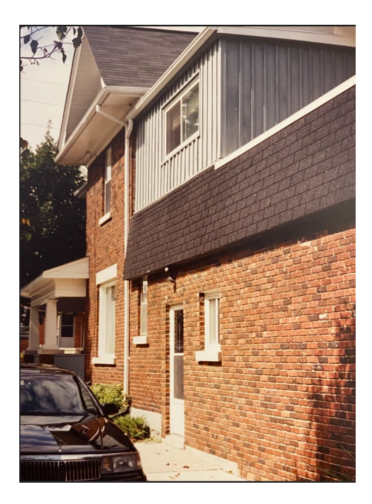
Photo 4. The southern elevation circa 1980s. This photo shows the new mansard roof and grey siding-clad portion of the addition. While original brick from the rear of the house was repurposed to clad the first storey of the addition, all portions of the building immediately to the west of the side door date from the 1970s (as demonstrated by the limit of the original foundation line to the west of the door).