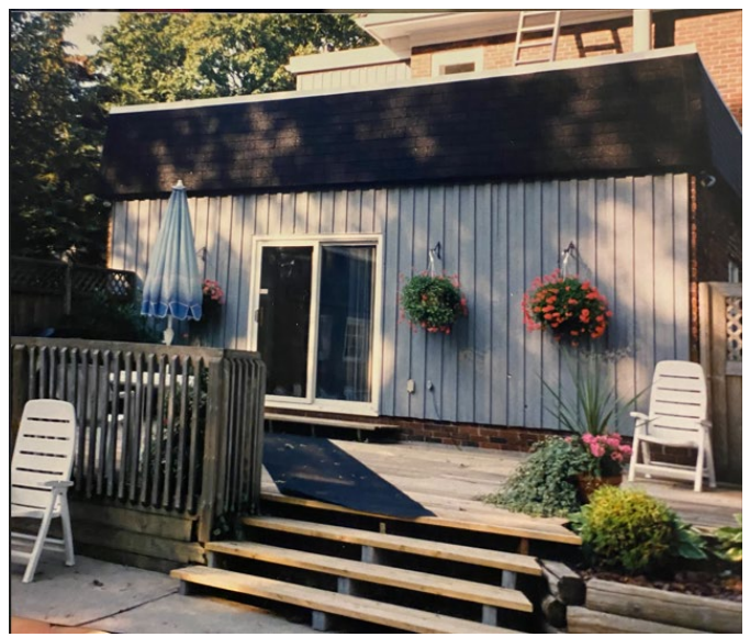
Photo 2. The new eastern (rear) elevation, with addition clad in grey siding