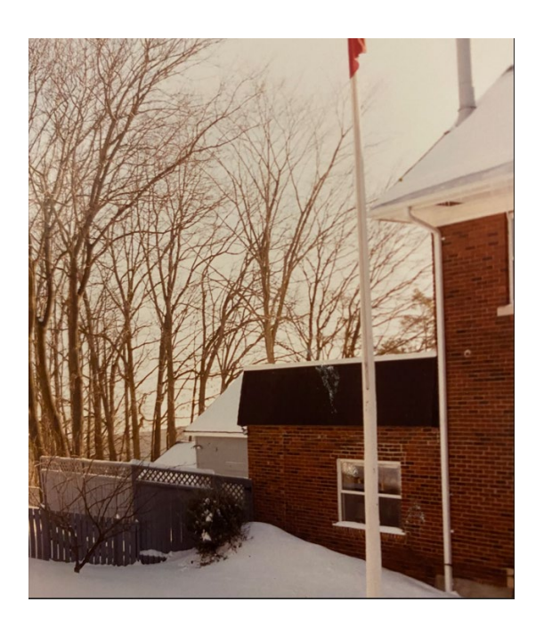
Photo 3. The northern elevation circa 1980. This photo shows the new addition, delineated by the mansard roof. Note that the brick used for this portion of the addition was repurposed from the original rear wall of the house.