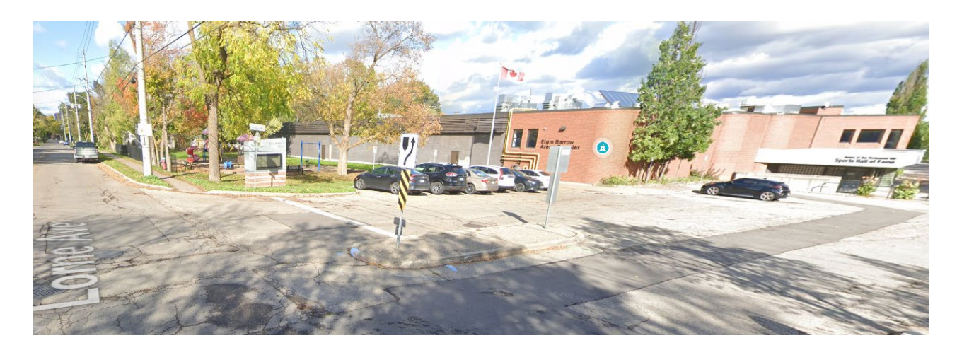
Elgin Barrow Arena Complex at 43 Church Street South, two properties north of the Property (Google Maps)

Surface parking lot immediately facing the Property (Google Maps)