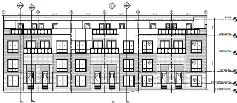
6 South Elevation 132' x 12'