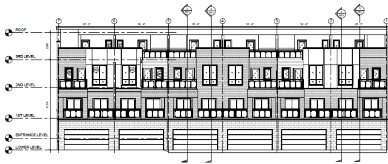
5 North Elevation 132' x 12'